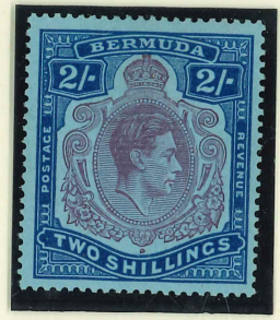
116b Horizontal Lines