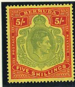
118b. Horizontal lines