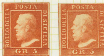
Plate 2- no dots or white spots - very even printing