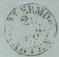
Fig. Don. Ryolo & C. Milazzo