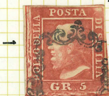
Plate 1- dent in top right corner and spot above nose