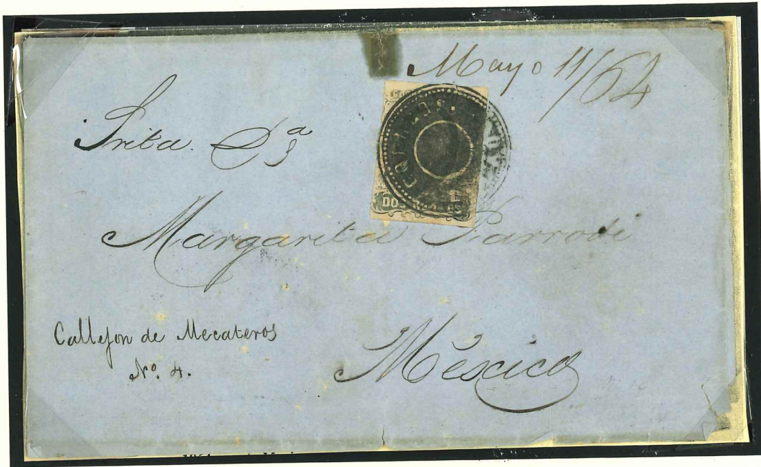
1864 may to Mexico