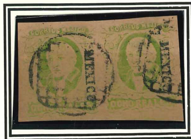
8R district MEXICO pair grill cancellation (est $600) + attest