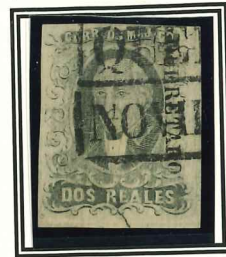
district in center