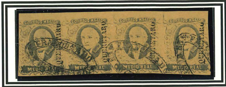
1861 issue, Medio Real district QUERETARO. 2nd stamp ovp. shifted upwards