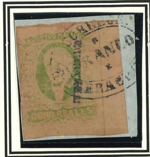
district and margins