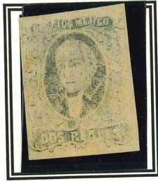
No district Ty-II