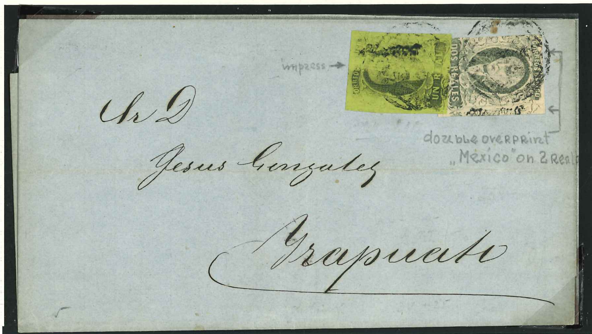
MIXED 2 ISSUES FRANKING: 1R. 1861 + 2R. 1867 (MEXICO dist.) addressed to Jrapucalo. 1R. printing defect. 2R. MEXICO dbl. print