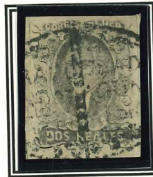
1861 ZR district in center