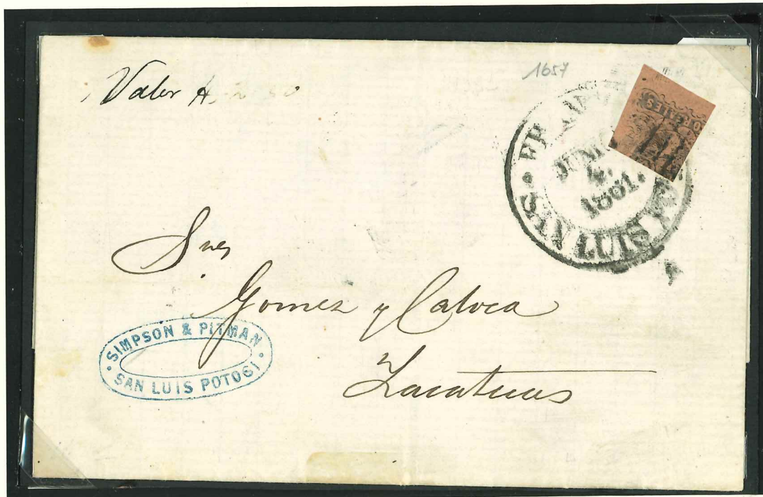
1/4 th 8 Rls tied by SAN LUIS POTOSI cds 4 June 1861 (att. cher.)