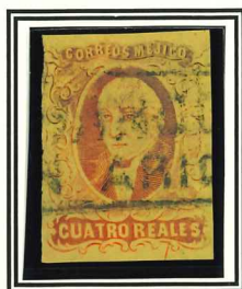
NO DISTRICT 4r