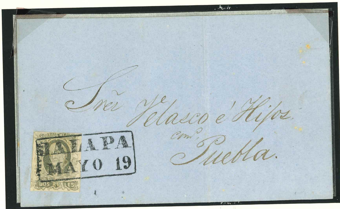
1862 May 19 from JALAPA to PUEBLA