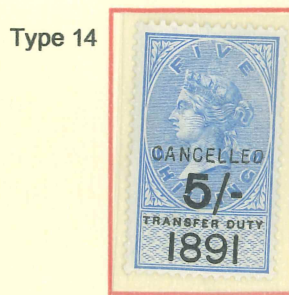
1889 Transfer Duty 5/- Surcharged Blue/Black