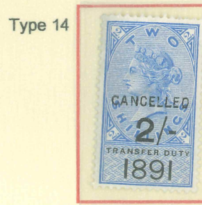
1889 Transfer Duty 2/- Surcharged Blue/Black