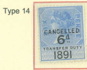
1889 Transfer Duty 6d Surcharged Blue/Black