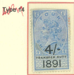
1889 Transfer Duty 4/- Surcharged Blue/Black