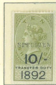
1889 Transfer Duty 10/- Surcharged Olive/Black