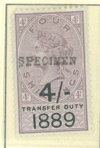
1889 Transfer Duty 4/- Surcharged Lilac/Black