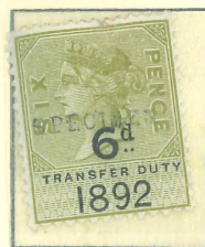
1889 Transfer Duty 6d Surcharged Olive/Black