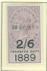
1889 Transfer Duty 2/6 Surcharged Lilac/Black