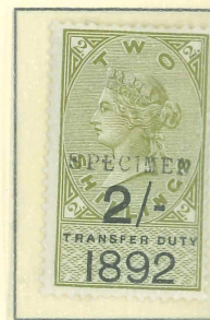
1889 Transfer Duty 2/- Surcharged Olive/Black