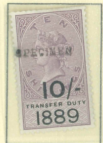
1889 Transfer Duty 10/- Surcharged Lilac/Black