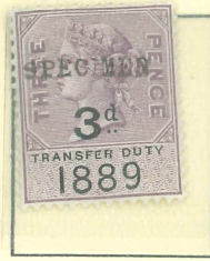
1889 Transfer Duty 3d Surcharged Lilac/Black

Normally De La Rue printed Revenue stamps in Lilac and Green but for these sets Orange, Blue and Olive were added.