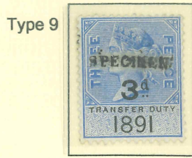
1889 Transfer Duty 3d Surcharged Blue/Black