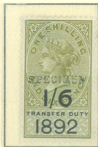
1889 Transfer Duty 1/6 Surcharged Olive/Black