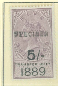
1889 Transfer Duty 5/- Surcharged Lilac/Black