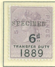
1889 Transfer Duty 6d Surcharged Lilac/Black