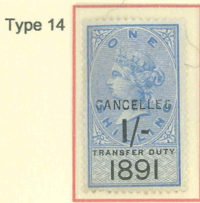
1889 Transfer Duty 1/- Surcharged Blue/Black