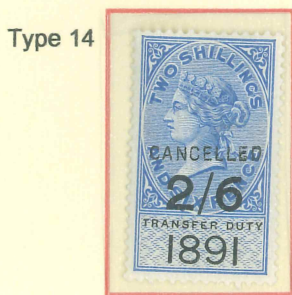
1889 Transfer Duty 2/6 Surcharged Blue/Black