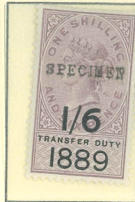
1889 Transfer Duty 1/6 Surcharged Lilac/Black