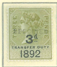
1889 Transfer Duty 3d Surcharged Olive/Black

Normally De La Rue printed Revenue stamps in Lilac and Green but for these sets Orange, Blue and Olive were added.