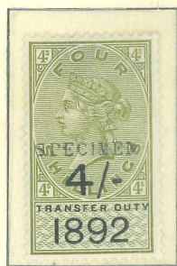
1889 Transfer Duty 4/- Surcharged Olive/Black