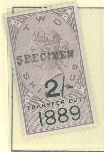
1889 Transfer Duty 2/- Surcharged Lilac/Black