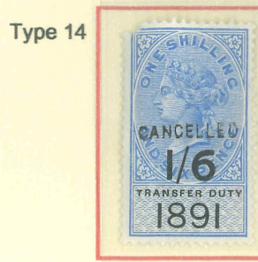
1889 Transfer Duty 1/6 Surcharged Blue/Black