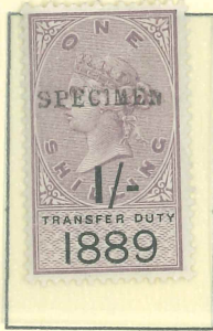
1889 Transfer Duty 1/- Surcharged Lilac/Black