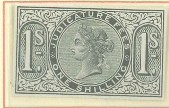
1881 Judicature Fees 1s Black Proof