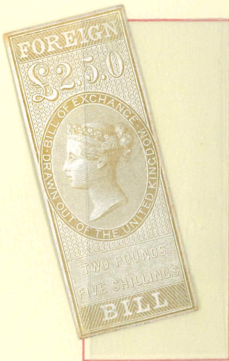
1854 Foreign Bill £2 5s Gold Colour Trial on card