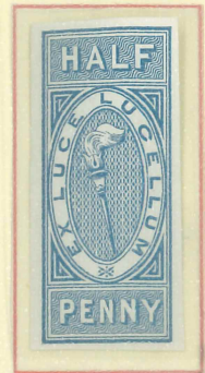
1871 Match Tax 1/2 Blue Trial Unissued