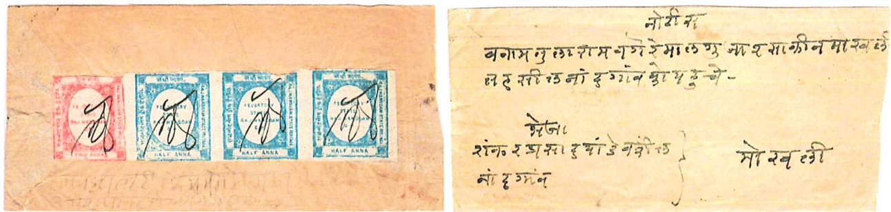
Fig 8 & 9: Author's cover bearing 1/2 anna strip of 3 + 2 anna