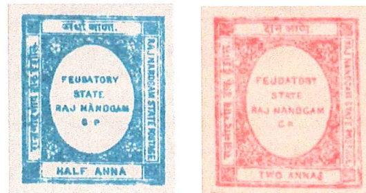
Fig 2: 1/2 anna blue (SG 1) Fig 3: 2 anna rose (SG 2)

Nandgaon's first issue consists of two stamps, a half anna blue Fig. 2 and a two annas rose Fig. 3. The half anna blue has a color variety listed in Gibbons as "dull blue" Fig. 4 but this color variety is not listed as used. Unused copies are relatively accessible but used stamps with genuine cancel are very difficult to acquire.