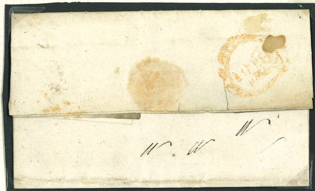
The "Mermaid" date stamp.