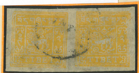
Cliches 5 and 3

33s0113 #17 2tr Yellow Commercially Used Pair of the "Error of Colour with PHARI Type VIII cancel!! Very few used copies of the colour error can be found .. all of them used at Phari. $150 (US)