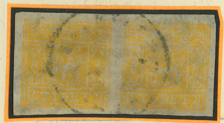
Cliches 10 and 8