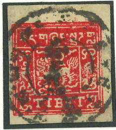
Cliche 3 Lhasa VIII 25¢