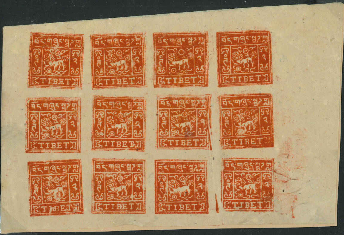
1 B Ice brown - UNCLASSIFIED SHADE by WATERFALL - VERY SCARCE # 227 F100