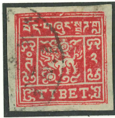
Cliche 4 $ 20