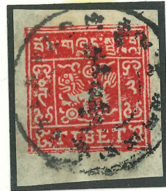
Cliche 11 cyanine - Flaw between last 2 Tibetan characters - top. $ 25