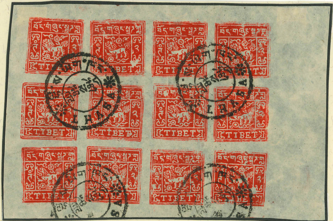
W - 185 - Complete Sheet of 2 Tr. BRIGHT SCARLET-RED, a deeper shade than the sheet above. Note cliché 5 has been pushed into the left margin and the N.E. corner of cliché 2 is above the N.W. corner of cliché 3. This shade must again have been an early printing (circa 1945) as the "B-flaw" on cliché 9 has not yet appeared. Note: ALL PRINTINGS PRIOR TO THE "B-FLAW" ARE SCARCE