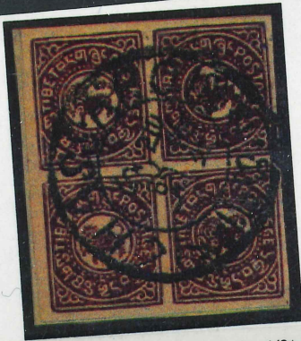
L37 #3 VF & Attractive Block of the 1/2tr Deep Violet (W-45) cancelled by VF & complete LHASA Type IV (Hel. T10) in black. This scarce cancel is the largest of all Tibetan cancels. $120 (US)