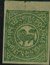
N20 #6 1 Sang Grey-Green tied to piece by perfect LHASA Type IV (Hel. T10) cancel. (This is the only example of this cancel tying a 1 Sang that I have seen!) $120 (US)