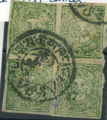
AA18 #1a VF 1/6tr, Deep Green (Shiny Period). Tied to piece by VF+ CHUSHU Type I (Hel. T1) cancel. Attractive example of this scarce small town cancel. $50 (US)

1/6 Tr block Apple green Flecks of shiny enamel waterfall 29 Type V (T13) cancel