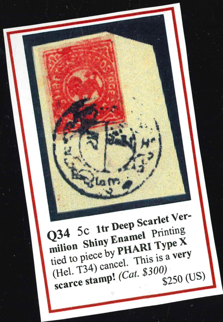
Q34 5c 1tr Deep Scarlet Vermilion Shiny Enamel Printing tied to piece by PHARI Type X (Hel. T34) cancel. This is a very scarce stamp! (Cat. $300) $250 (US)