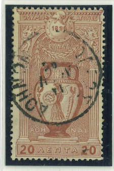
1. ATHENS – TRIPOLIS