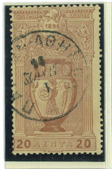
6. PATRAS – ATHENS