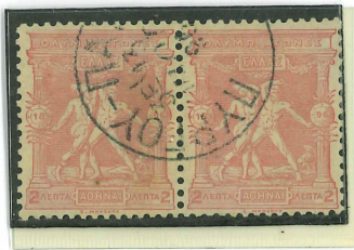
3. PYRGOS – PATRAS 2 L. in pair