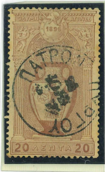
5. PATRAS – PYRGOS