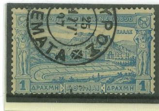
4. SYROS - DEMATA