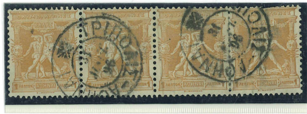
2. TRIPOLIS – ATHENS 1 L. four single