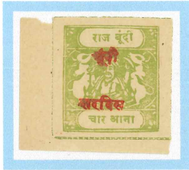
Like SG O4aA Genuine red overprint Toned medium wove paper Type A inscription F1 forgery cliché C lower left marginal copy

Black genuine Gibbons type O1 Bundi Official overprints on forged Bundi stamps are known to have been distributed as new issues, supplied by the Bundi post office, apparently through the action of dishonest officials. It is probable that these rare red genuine overprints came on the market in the same way.