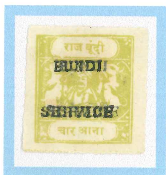
Like SG O19B Genuine black small British overprint White pelure paper Type C inscription F2 forgery cliché C

Black genuine Gibbons type O2 (small British overprints) Bundi Official overprints on forged Bundi Sacred Cow stamps; the second type forgery F2. Neither the 4 annas or the 12 annas values were known to Bennis with an F2 type forgery. Like the F1 forgery, the F2 forgeries were probably distributed as new issues, supplied by the Bundi post office, apparently through the action of dishonest officials. Unlike the F1 forgery the paper of the F2 forgeries is a white pelure paper and four clichés have been identified all with different characteristics from the F1 forgeries clichés. To date the position of the F2 forgeries are unknown in the apparent sheet of four even though they have an arbitrary A, B, C and D designation.