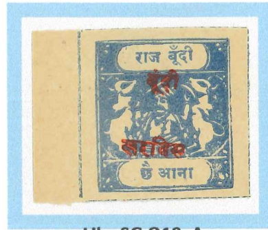
Like SG O19aA Genuine red overprint Toned medium wove paper Type C inscription F1 forgery cliché A? upper left on sheet of four with left margin

OFFICIAL. 1919 'Sacred Cows' TYPE F1 FORGERIES OF 6a ('A') AND 4a ('C') EACH WITH GENUINE TYPE O1 OPT IN RED, FINE 'unused'. RARE AND ATTRACTIVE. BENNS DOES NOT RECORD ANY RED OPTS ON THESE FORGERIES, AND THESE ARE THE FIRST WE HAVE EVER SEEN.