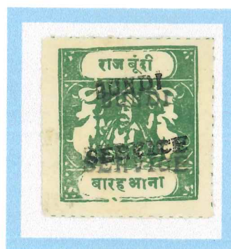
Like SG O22B Genuine black small British overprint White pelure paper Type C inscription F2 forgery cliché A