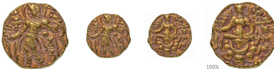
1150 Gupta Empire , Chandragupta II, c. 380-413, AV dinar, 8.09 g. (19 mm). Archer.

Special features: elegant king with tight layers of curls, wearing tailed tunic over trousers and sash tied with a knot, tall standard with detailed Garuda. Goddess seated on lotus holding fillet in right hand and lotus with left hand on knee, with legend srivikkramah . Kumar, TOTGE 2024, Class III. Raven, CG2/group 9.