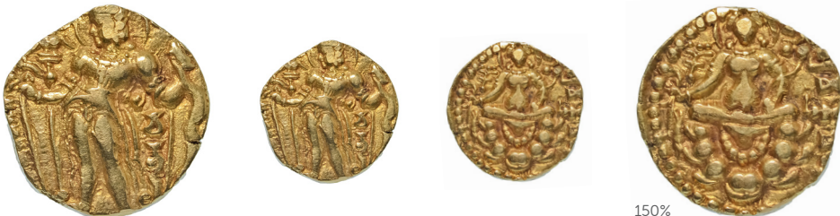
1152 Gupta Empire, Chandragupta II, c. 380-413, AV dinar, 7.85 g. (20 mm). Archer.