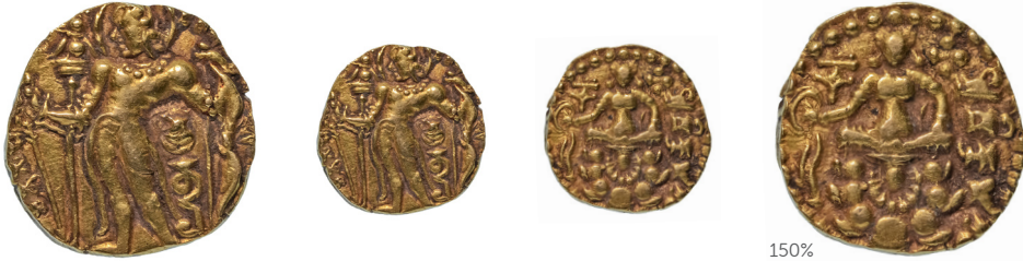
1151 Gupta Empire, Chandragupta II, c. 380-413, AV dinar, 8.00 g. (20 mm). Archer.

Special features: king with curving layers of curled hair, wearing tunic with long tails over loin cloth. Goddess seated on lotus with hair buns in attractive detail, with legend srivikkramah . Kumar, TOTGE 2024, Class III, variety G2. Raven, CG2/group 9.