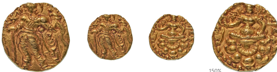
1149 Gupta Empire , Chandragupta II, c. 380-413, AV dinar, 8.14 g. (20 mm). Archer.

Special features: king with curving layers of curled hair, wearing tunic with long tails over trousers and a sash tied on the waist. Goddess seated on lotus with legend srivikkramah . Kumar, TOTGE 2024, Class III, variety A7.1. Raven, CG2/group 9.