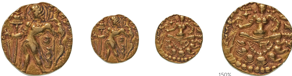
1153 Gupta Empire, Chandragupta II, c. 380-413, AV dinar, 7.96 g. (20 mm). Archer.

Special features: elegant king with curving layers of curls struck in great detail, wearing tailed tunic over loin cloth, beside a tall standard with detailed Garuda. Goddess seated on lotus and holding diadem and lotus flower with one hand on knee, legend srivikkramah . Kumar, TOTGE 2024, Class III, variety G2. Raven, CG2/group 9.