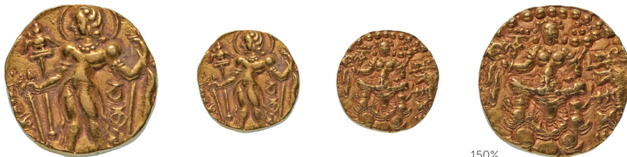
1148 Gupta Empire , Chandragupta II, c. 380-413, AV dinar, 8.01 g. (19 mm). Archer.

Special features: elegant king with curving layers of curls, wearing tunic with long tails over loin cloth, standing looking to left. Tall and prominent Garuda standard rendered with particular detail. Goddess seated on lotus with legend srivikkramah . Kumar, TOTGE 2024, Class III, variety A5.1.2. Raven, CG2/group 9.