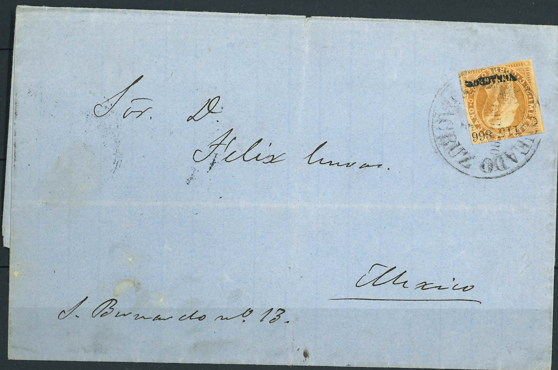
25c engraved, district VERACRUZ. Invoice 115-1866 to MEXICO, February 4/1866.