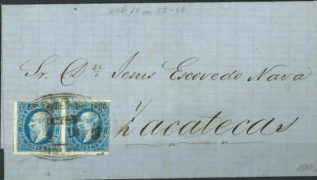
13c litho, paire, district SAN LUIS POTOSI. Invoice 58-1866, sub-number 18 to ZACATECAS -SALINAS. October 4/1866 Salinas. Letter writing on one page. RR.