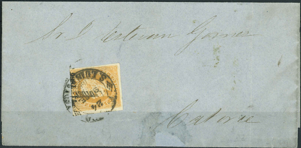
25c litho, district SAN LUIS POTOSI. Invoice 74-1866 to CATORCE. September 24/1866.