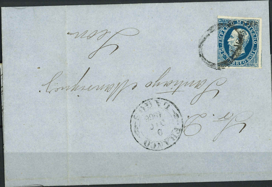
13c litho, district LAGOS. Invoice 96-1866 to LEON. December 9/1866. Schatz. 666 + 667. Letter writing on one page.