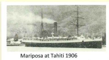
Mariposa at Tahiti 1906