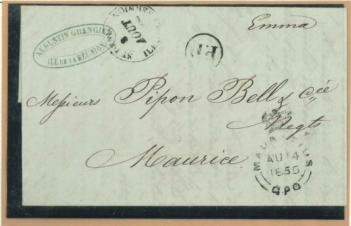
1855 Letter from ST DENIS REUNION to MAURITIUS. CDS ST DENIS IN BLACK and CIRCLE P.P. in black applied at St Denis SENDERS cachet in GREEN. Arrival CROWN CIRCLE CDS Aug 14 1855 in black.