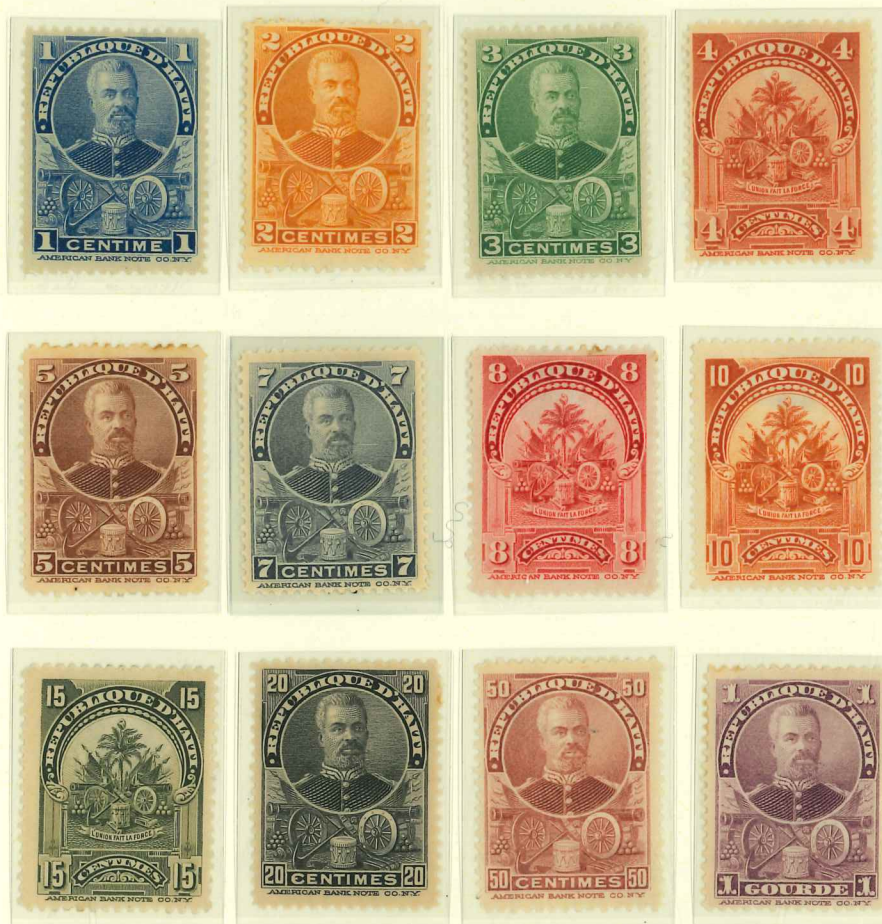
12 denominations (Yv. 47, 49, 51, 52, 53, 55, 56, 57, 58, 59, 60 and 61)

Typographed, perf. 12, white machine-made paper, without watermark, in sheets of 100