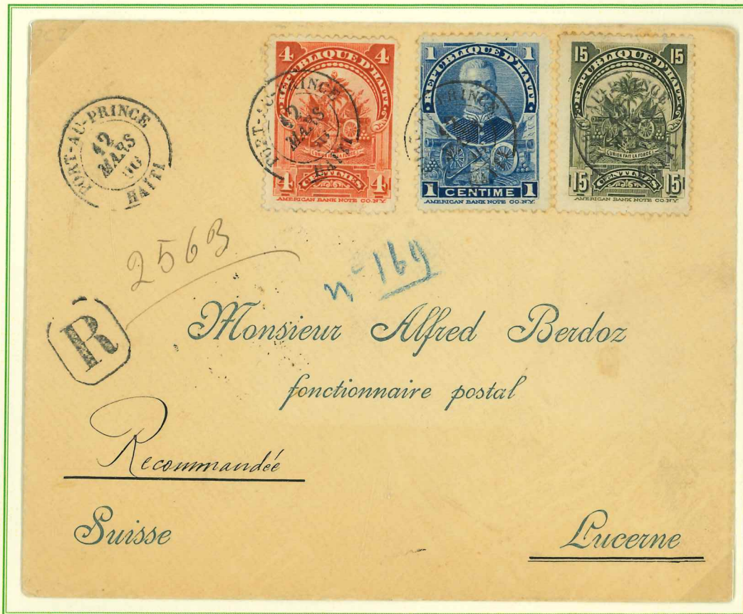
12 March 1900, from Port au Princes addressed to Lucerne (Switzerland), delivered on 30 of the same month. A 20 centimes Registered single rated cover. The pre-printed envelope most probably containing postage stamps.