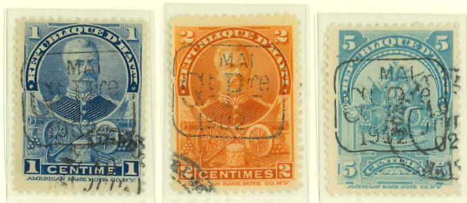
Stamps with a very weak impression

THE 'PROVISIONAL GOVERNMENT' SERIES, 1902