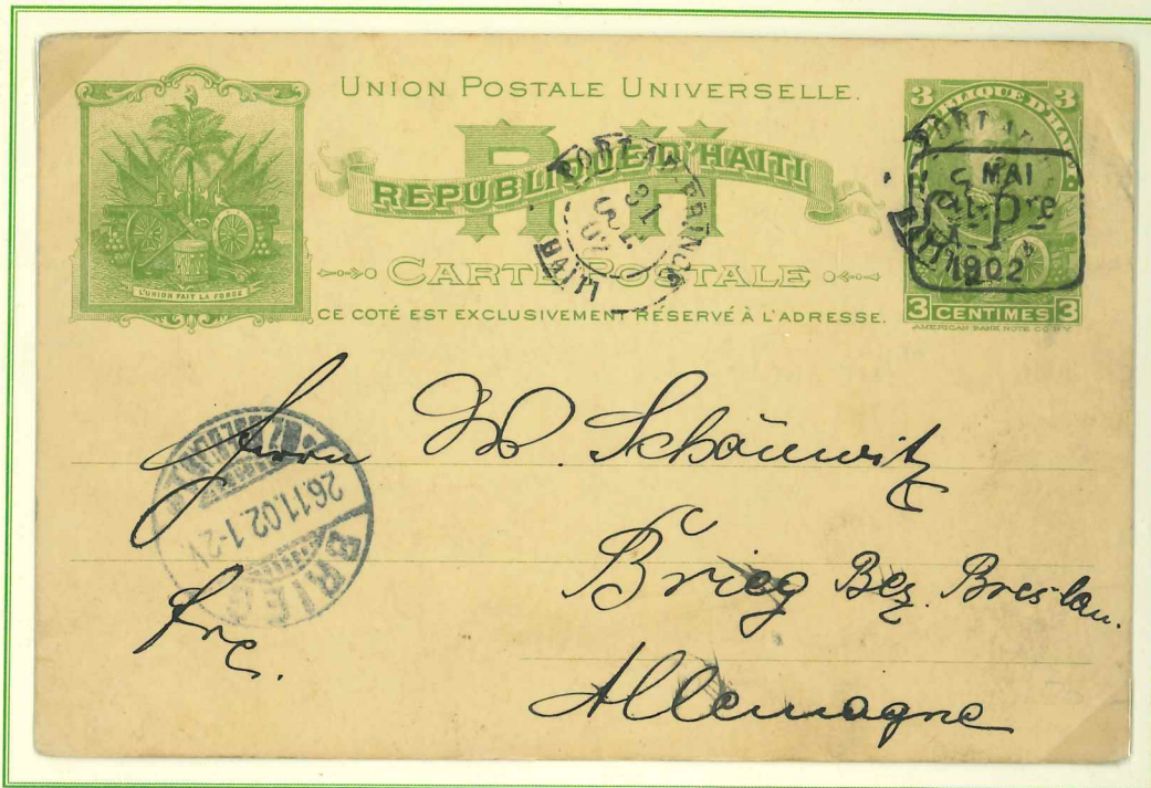
31 October 1902, a 3 centimes postal stationery, from Port au Prince addressed to Breslau (Germany), delivered on 26 November.