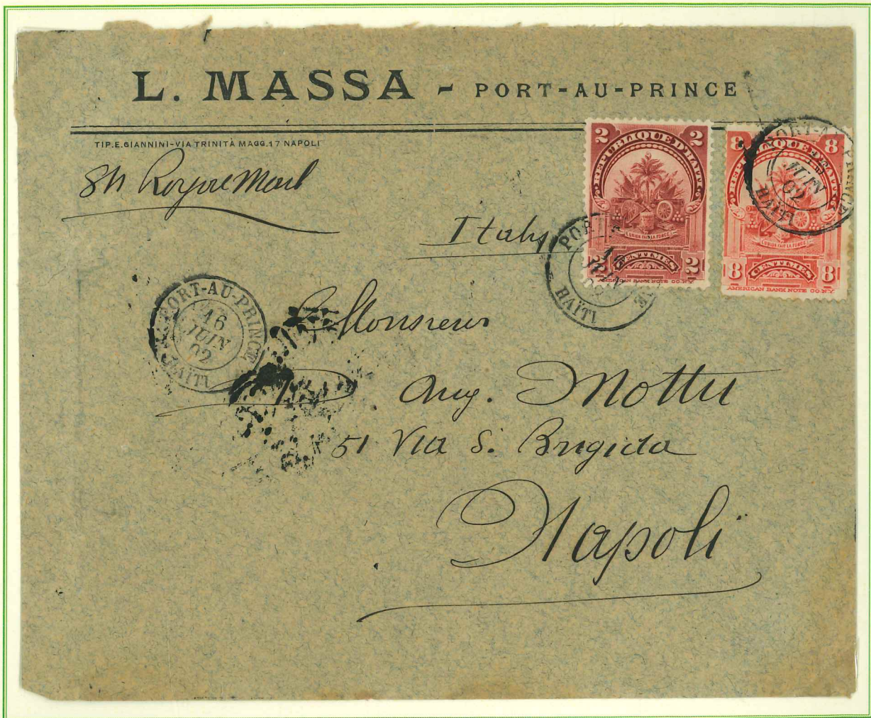
16 June 1902, from Port au Prince addressed to Napoli (Italy), delivered on 5 July. Endorsed 'Per Royal Mail'. A 10 centimes single rated letter.