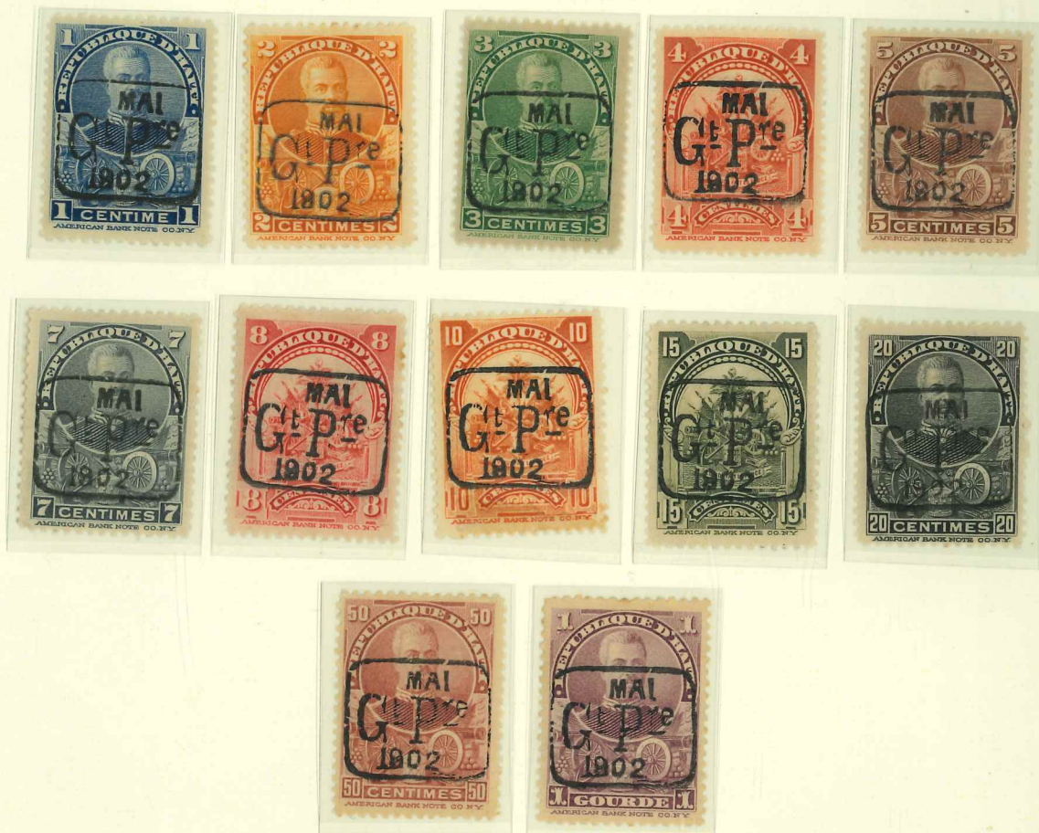
Overprinting on 1898 issue (Yv. 62, 64, 66, 67, 68, 70, 71, 72, 73, 74, 75, 76)