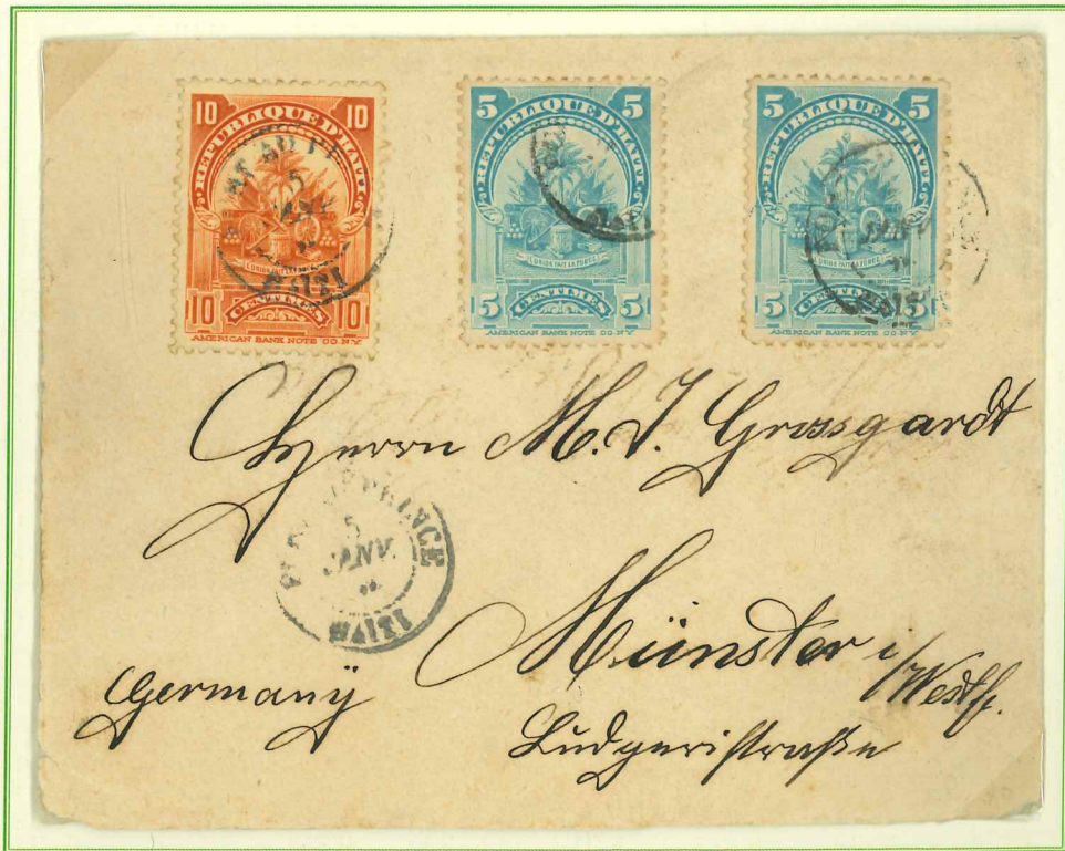
5 January 1904, from Port au Prince addressed to Münster (Germany), delivered on 5 July.