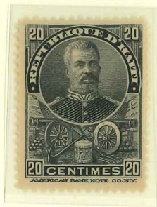
20c. black (Yv. 59)

THE PRESIDENT TIRESIAS SIMON SAM SERIES, 1898