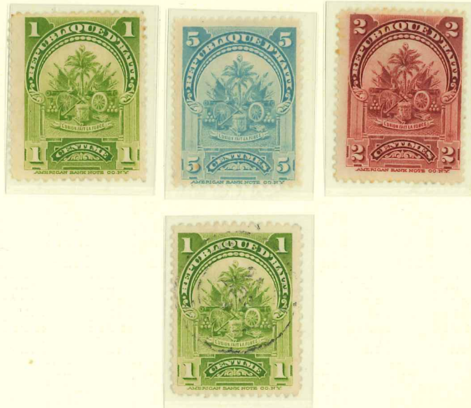
1c. yellow-green (Yv. 48), 2c. lake (Yv. 50), 5c. light blue (Yv. 54)

Typographed, perf. 12, white machine-made paper, without watermark, in sheets of 100