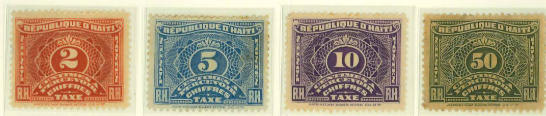
2c. vermilion (Yv. 10), 5c. blue (Yv. 11), 10c. violet (Yv. 12), 50c. olive (Yv. 13)