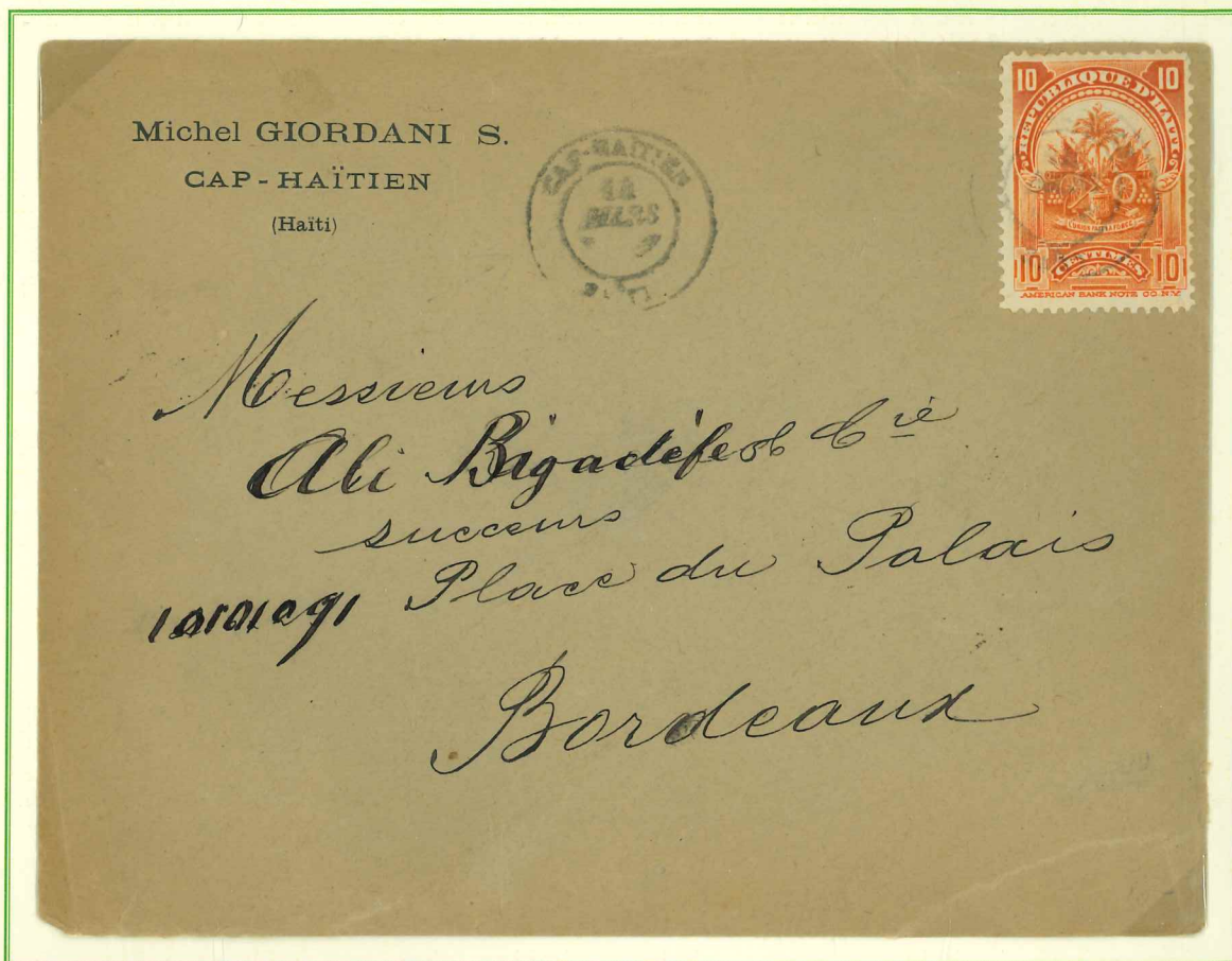
14 March 1904, from Cap Haitiens addressed to Bordeaux (France), delivered on 30 of the same month. A 10 centimes single rated cover.