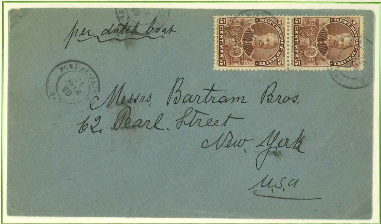
21 February 1899, from Port au Prince addressed to New York, a simple letter rated 10 centimes.