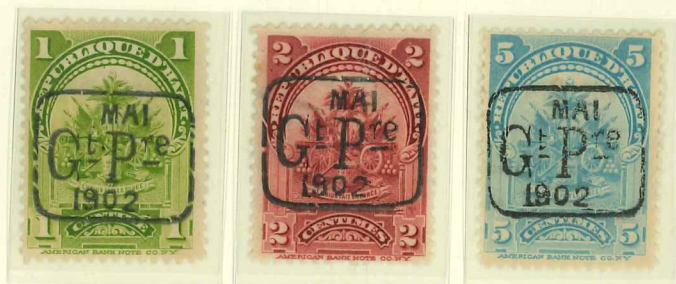
Overprinting on 1899 issue (Yv. 63, 65, 69)