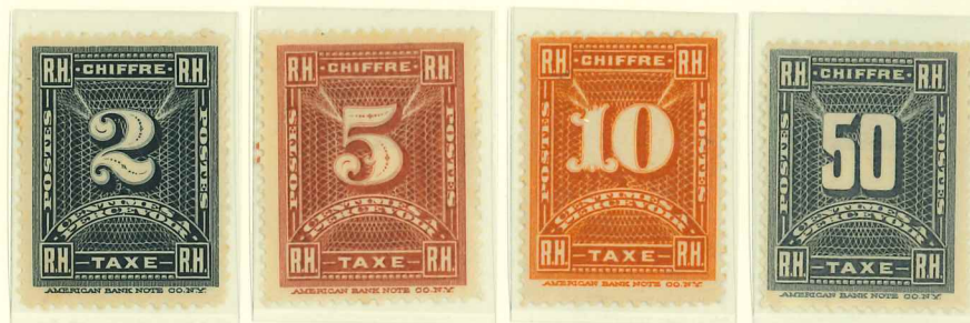
2c. blacks (Yv. 1), 5c. red brown (Yv. 2), 10c. brown orange (Yv. 3), 50c. slate (Yv. 4)