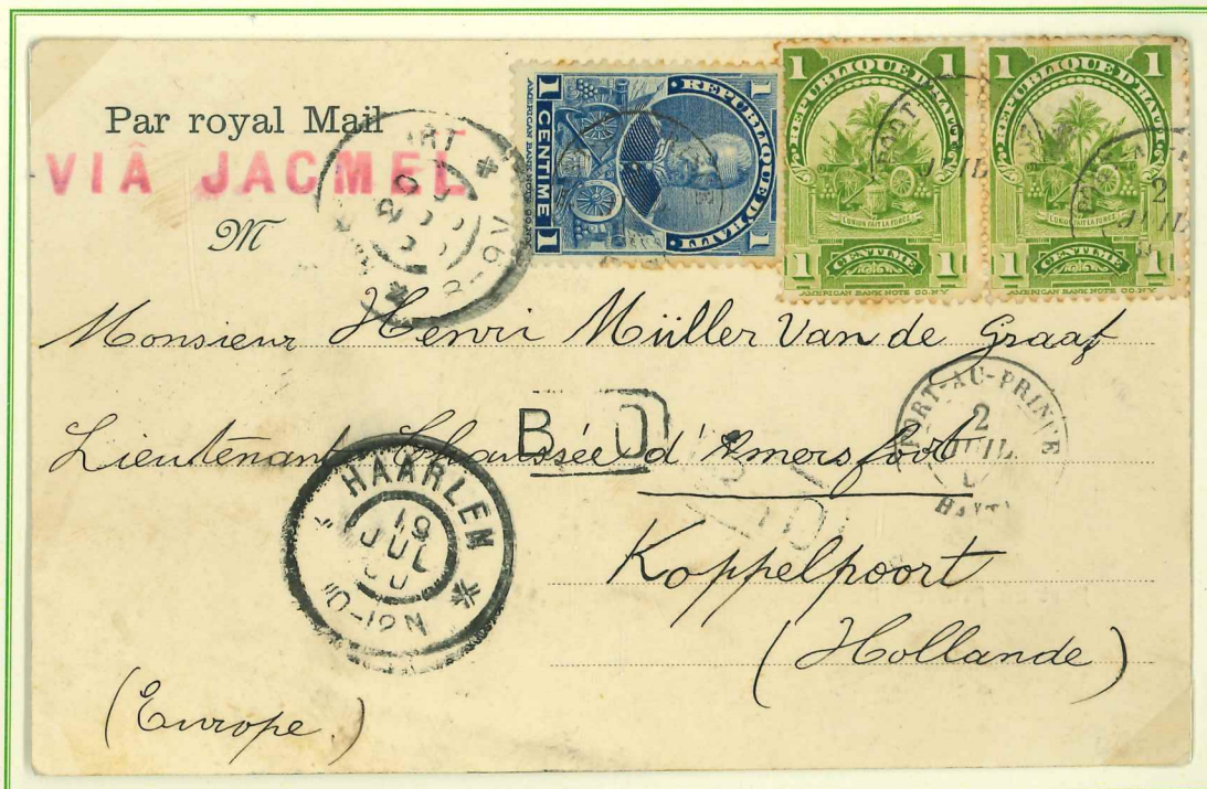
1 July 1900, a postcard showing the Custom House (Douane) from Port au Prince addressed to Koppelpoort (Low Lands), delivered on 19 July.