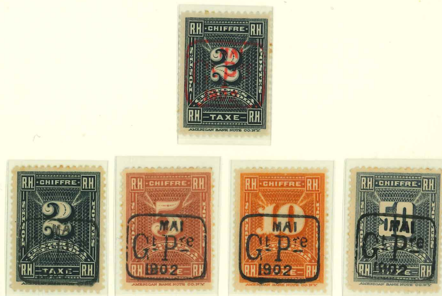
2c. blacks (Yv. 5, 5a) ovpd. in red or in blacks, 5c. red brown (Yv. 6), 10c. brown orange (Yv. 7), 50c. slate (Yv. 8)

A new design for Postage Due stamps was adopted in 1906.