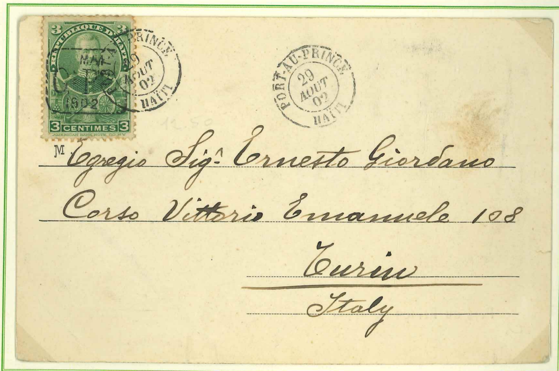
29 August 1902, a postcard franked with a single 3 centimes, from Port au Prince addressed to Torino (Italy).