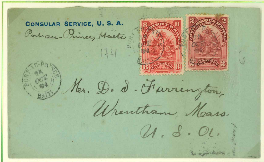
25 October 1901, from Port au Prince addressed to Wrentham (USA), delivered on 4 November