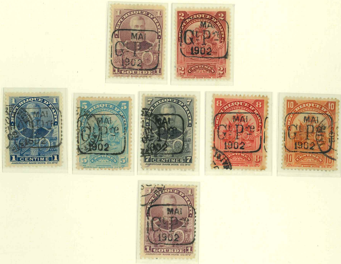
Mint and used copies.

The stamp has a strong dent in the lower left frame and the word MAY is larger and more regular. There are other small differences