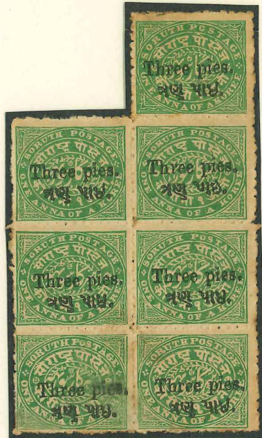
'THREE PIES' in Black on 1 Anna Emerald- Green (shade), on toned wove paper, Unused irregular block of 7, SG 33.

Indian Feudatory State Nawab Mahabat Khan III 1913