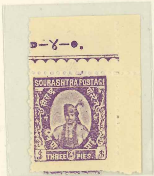
3p mauve (shade), clear impression, large pin perf. 12, SG 45. Unused marginal (top right corner) single. Fine.