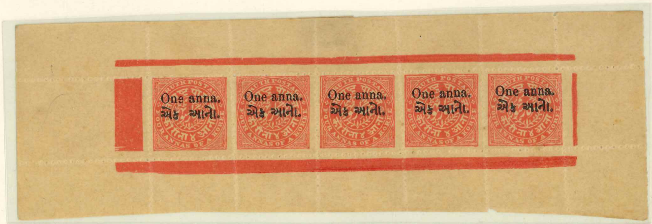
'ONE ANNA' on 4cs. red (shade) on toned wove paper