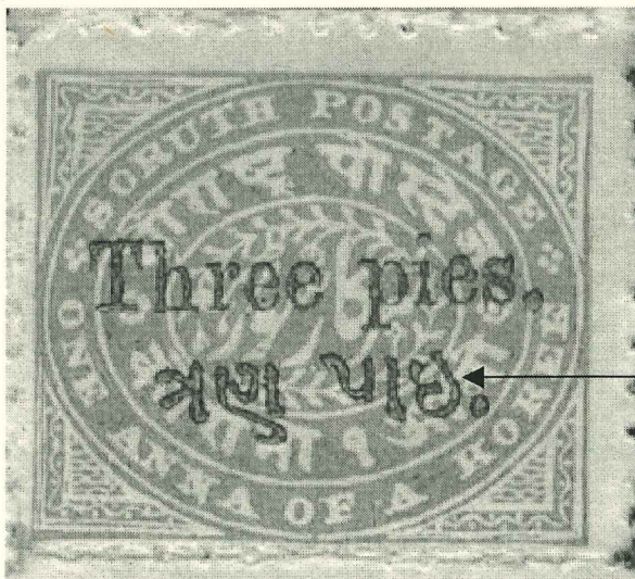
Position 9 stamp has a variety where the last Gujarati character has a bent inward right side. This is constant to all printings.