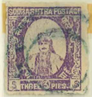
3p. mauve (shade), blurred impression, large pin perf. 12, SG 44. Used single (1). Fine.