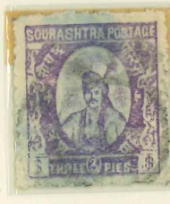
3p. mauve (shade), clear impression, large pin perf. 12, SG 45. Used singles (3). Fine.