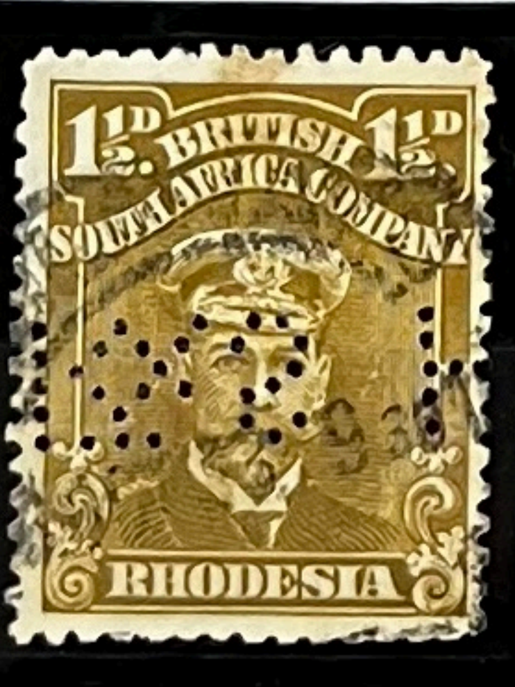
Haddon & Sly perfin inverted/reversed