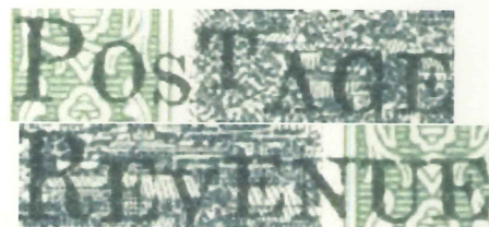
Small S and raised T in Postage and Small V in Revenue Position 14 (R3/4)