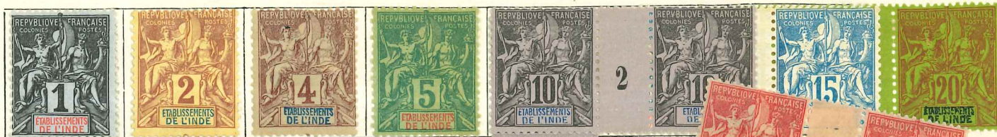
Black and azure