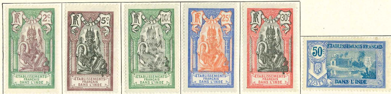
(2 c.) purple and green