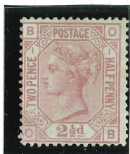
SG 138 PL1 White center