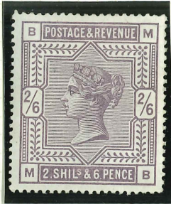
SG 178 wh pap.