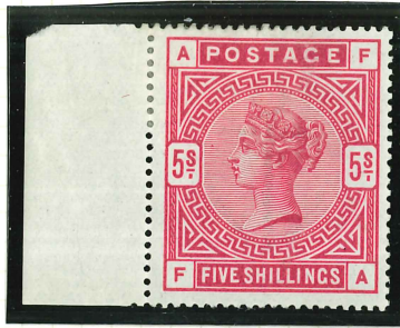
SG 180 wh pap cut!