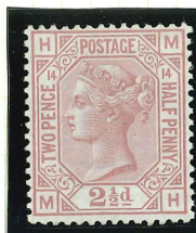
SG 144 PL14 White center, in S.G.