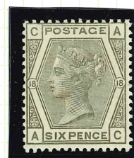
SG 161 PL18