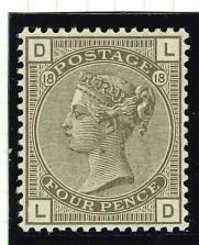
SG 160 PL17