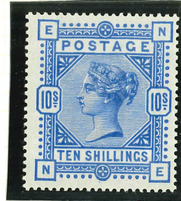
SG 183 wh pap