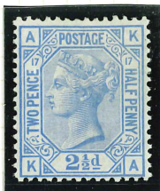
SG 142 PL17 in S.G.