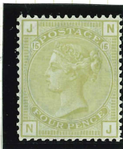
SG 153 PL15