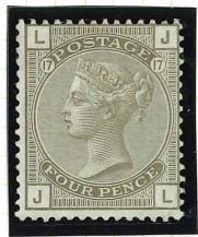
SG 154 PL17