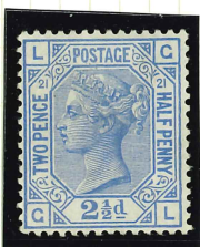
SG 157 PL21