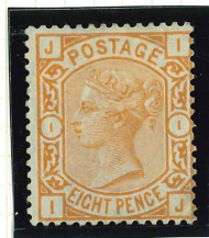
SG 156 PL12