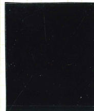
SG 156a Purple center!