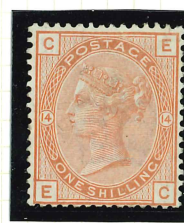
SG 163 PL14