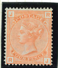
SG 152 PL15