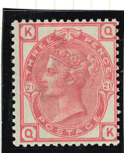
SG 158 PL21