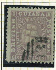
TWELVE CENTS: PURPLE