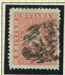
EIGHT CENTS; PINK