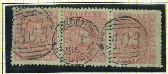
A scarce used strip of three, with the Georgetown 'A03' duplex obliterator.