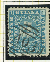
FOUR CENTS: BLUE