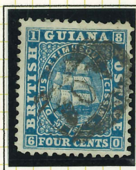
FOUR CENTS: DEEP BLUE