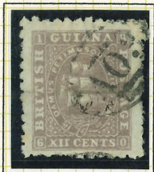
TWELVE CENTS; LILAC