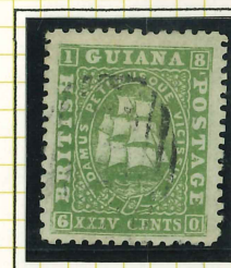
TWENTY FOUR CENTS; GREEN