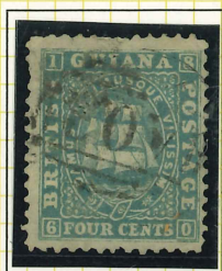
FOUR CENTS: BLUE