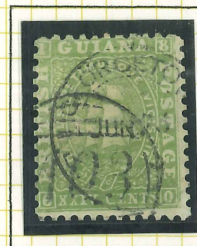
TWENTY-FOUR CENTS: GREEN

The original ONE CENT colour caused confusion with the EIGHT CENTS. After experimenting with a reddish brown, a brown colour was chosen. Even this was short-lived, and it was replaced by a ONE CENT black.