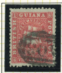
EIGHT CENTS; CARMINE