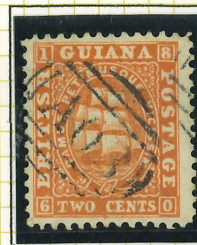
TWO CENTS: DEEP ORANGE