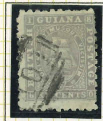
TWELVE CENTS; GREY-LILAC