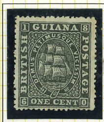
ONE CENT; BLACK