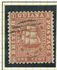
ONE CENT: REDDISH BROWN