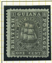
ONE CENT: BLACK