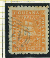
TWO CENTS; ORANGE