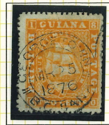
TWO CENTS; ORANGE