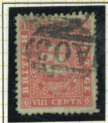
EIGHT CENTS; PINK