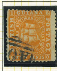
TWO CENTS: ORANGE