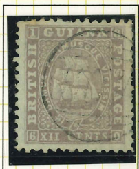
TWELVE CENTS: LILAC