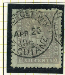
TWELVE CENTS; GREY-LILAC