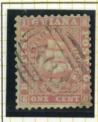
ONE CENT: PALE ROSE