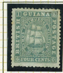
FOUR CENTS; BLUE