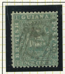
FOUR CENTS; GREYISH BLUE