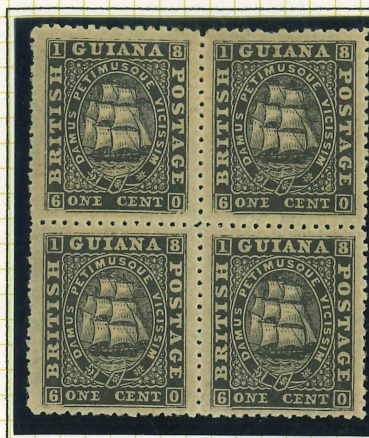
ONE CENT; BLACK