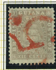
TWELVE CENTS: GREY-LILAC

The TWELVE CENTS is surcharged with the '5d' Accountancy Mark, the amount levied by the Imperial Post Office on letters using the RMS Packet Company's ships to Britain.