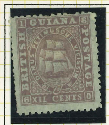
TWELVE CENTS; BROWNISH-LILAC