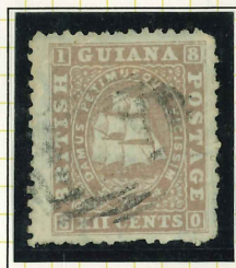
TWELVE CENTS; BROWNISH PURPLE