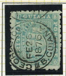
FOUR CENTS; BLUE