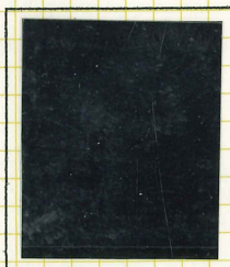
TWELVE CENTS; LILAC