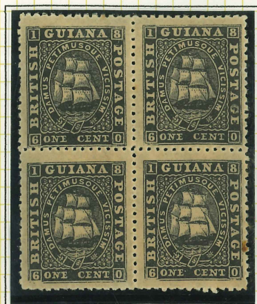
ONE CENT; BLACK