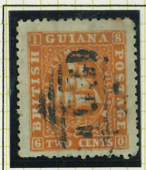
TWO CENTS; ORANGE