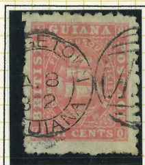
EIGHT CENTS; BROWNISH PINK