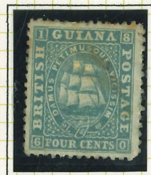
FOUR CENTS; BLUE