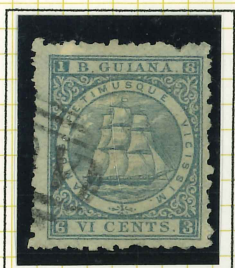
SIX CENTS; MILKY BLUE