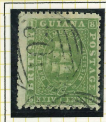
TWENTY-FOUR CENTS; GREEN