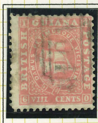
EIGHT CENTS: PINK