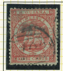
FORTY-EIGHT CENTS; RED