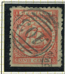
FORTY-EIGHT CENTS; CRIMSON