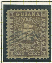
ONE CENT: BROWN