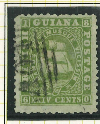
TWENTY-FOUR CENTS: GREEN