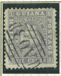
TWELVE CENTS: LILAC