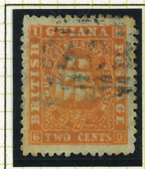
TWO CENTS; DEEP ORANGE