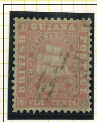
EIGHT CENTS: PINK