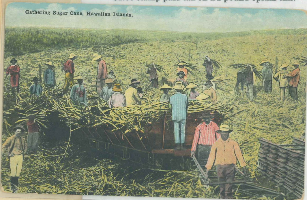
Gathering Sugar Cane, Hawaiian Islands.

$1.00 stamp paid tax on 1/2 pound opium tins.