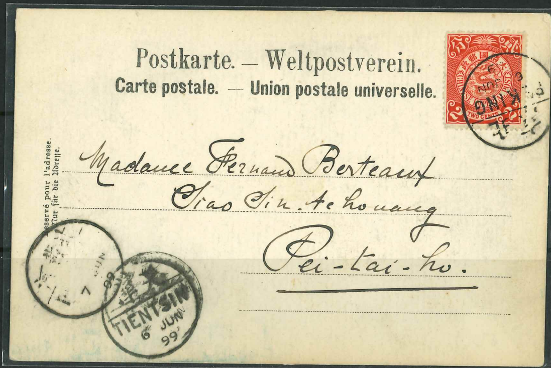
CHINA $100 CHINA. 1899. Picture post card of 'Opium Smokers, Shanghai' addressed to Pei-Tai-Ho bearing Chinese Imperial Post SG 110, 2c scarlet tied by Peking date stamp routed via Tientsin with Pei-Tai-Ho arrival. Very fine early card used at domestic rate.