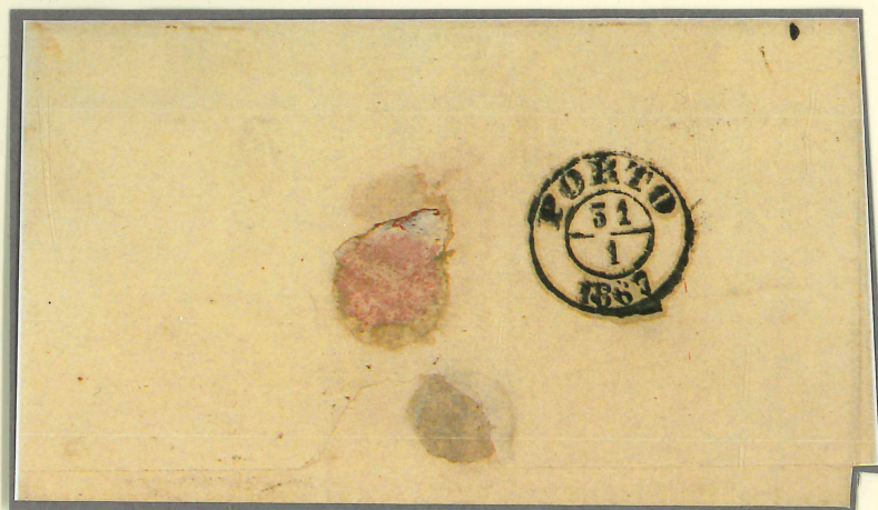
80% reduced copy of reverse