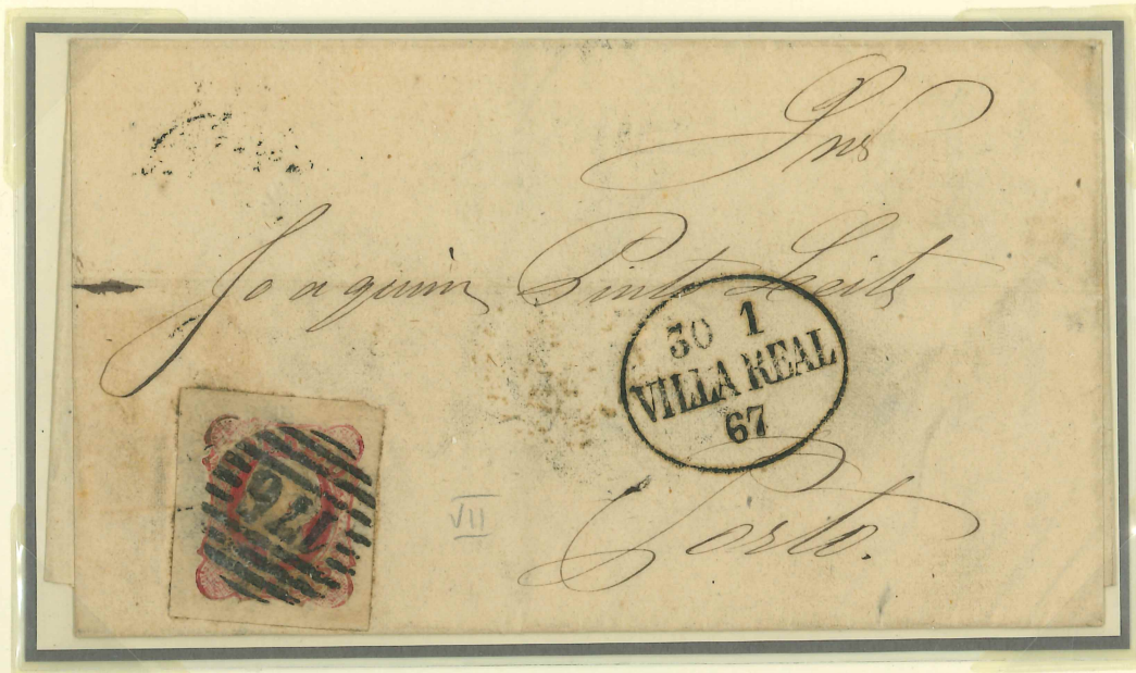
Villa Real (30 January, 1867) to Porto (31 January, 1867) "176" Numeral Grilled Cancel: Villa Real