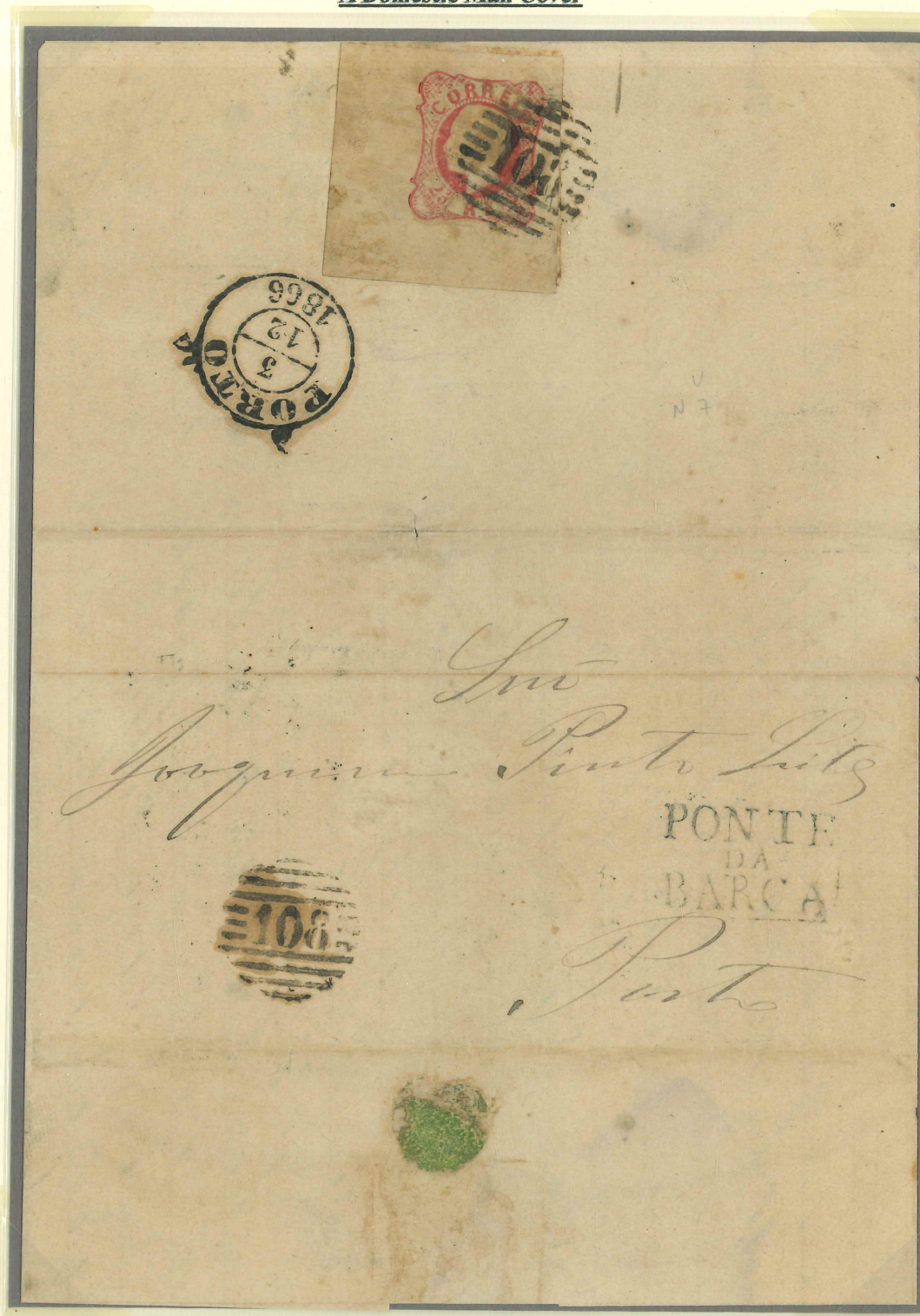
Ponte da Barca (2 December, 1866) to Porto "108" Numeral Grilled Cancel: Ponte da Barca "PONTE DA BARCA" Blue Town Mark