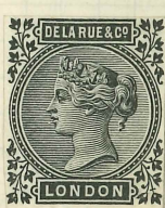
Ink recipes from the De La Rue Ink Recipe Book for the 2s and 2s6d postage and revenue stamps. The De La Rue labels attached to each recipe show the colour resulting from printing using ink made with that recipe. The back of the page has recipes for the Transvaal 2s6d and 5s revenue stamps.