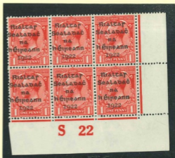
CONTROL BLOCK FEATURES and VARIETIES

'POSTAGE' watermark displaced Overprints display major shift to the left