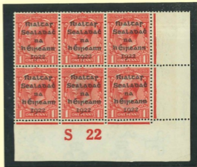
CONTROL BLOCK FEATURES and VARIETIES

'POSTAGE' watermark misplaced and reversed '1' in left margin