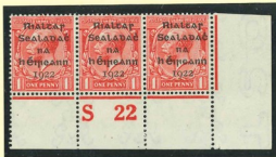
CONTROL BLOCK FEATURES and VARIETIES

'POSTAGE' watermark misplaced 'GvR' watermark shift to the left