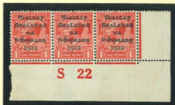
CONTROL BLOCK FEATURES and VARIETIES

Reversed '1' in right margin GvR watermark shift to the left