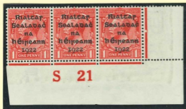
CONTROL BLOCK FEATURES and VARIETIES