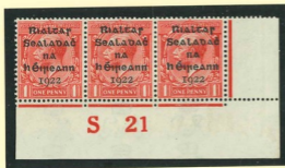
CONTROL BLOCK FEATURES and VARIETIES

White line flaw in top loop of 'S' and flat top to '1' of 'S21'