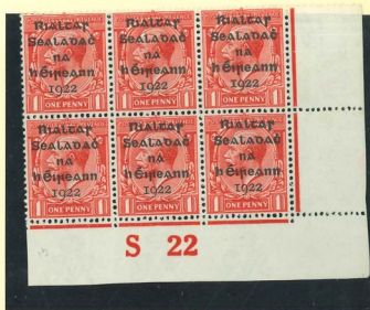
CONTROL BLOCK FEATURES and VARIETIES