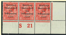
CONTROL BLOCK FEATURES and VARIETIES

Flat on outer surface of top curve of 'S'