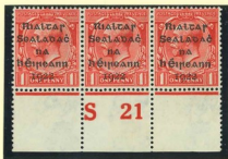
CONTROL BLOCK FEATURES and VARIETIES

Flat on outer surface of top curve of 'S'