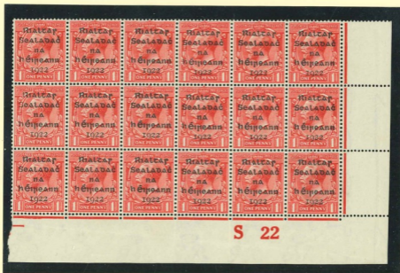
CONTROL BLOCK FEATURES and VARIETIES

'POSTAGE' watermark misplaced and reversed '1' in left margin