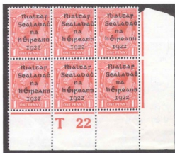
Printers Plate Overprint Stereo Setting 2