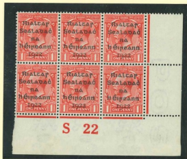
CONTROL BLOCK FEATURES and VARIETIES