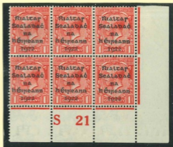
CONTROL BLOCK FEATURES and VARIETIES