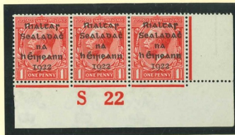
CONTROL BLOCK FEATURES and VARIETIES