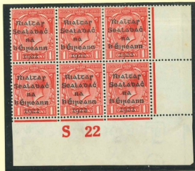
CONTROL BLOCK FEATURES and VARIETIES

'POSTAGE' watermark misplaced Reversed '1' in left margin