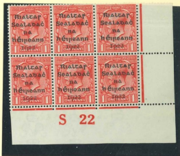
CONTROL BLOCK FEATURES and VARIETIES

UF1t Blotted second 'A' in 'RIALCAP' - stamp R20/12