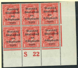
CONTROL BLOCK FEATURES and VARIETIES Stereo setting 2 alignment varieties from Rows 19 & 20 stamps 10, 11, 12