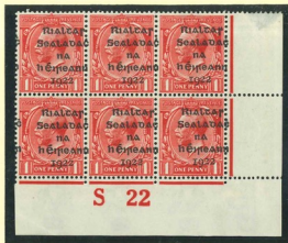
CONTROL BLOCK FEATURES and VARIETIES