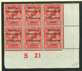
CONTROL BLOCK FEATURES and VARIETIES

'POSTAGE' watermark misplaced White line flaw in top loop of 'S' and flat top to '1' of 'S21'