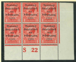
CONTROL BLOCK FEATURES and VARIETIES