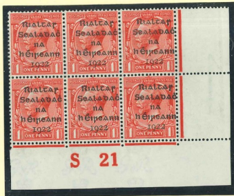
CONTROL BLOCK FEATURES and VARIETIES

'1' in right margin UF1r Broken first '2' in '1922' - stamp R19/10