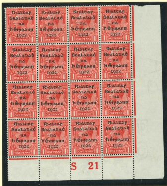
CONTROL BLOCK FEATURES and VARIETIES

'POSTAGE' watermark misplaced and A2 in margin