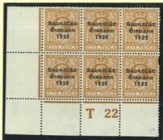
CONTROL BLOCK FEATURES and VARIETIES Setting 2 from 4 x 4 stereotypes and part 4 x 3 stereotypes

(3 x umm incl. control, stamp R20/3 damaged)