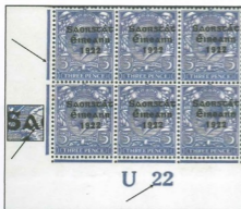
TC155 Imperforate Proof Control Block