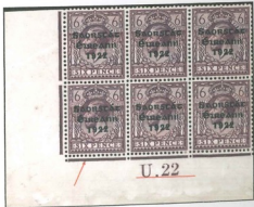
TC164 Imperforate Proof Control Block

R20/2 first 'c' in 'SAORSTAT' undamaged, see fig. 51.