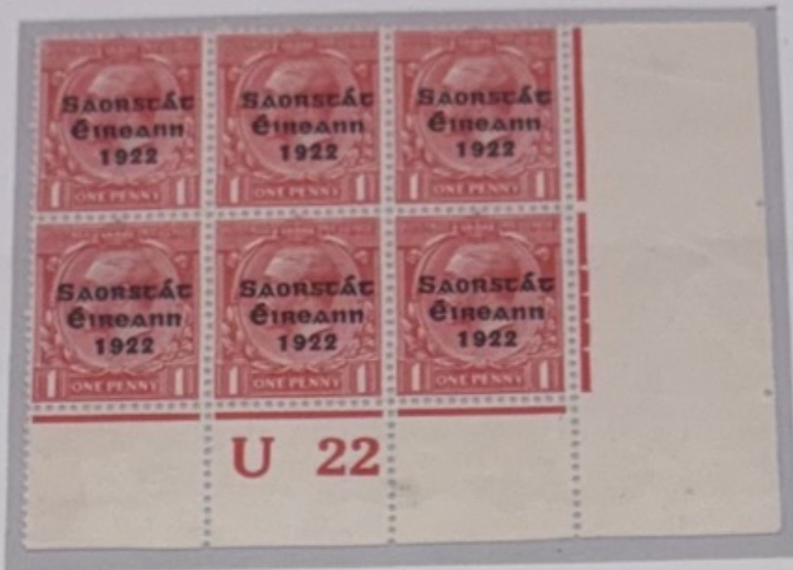
9T U22 Perforated Plate 93 Overprint Setting 1