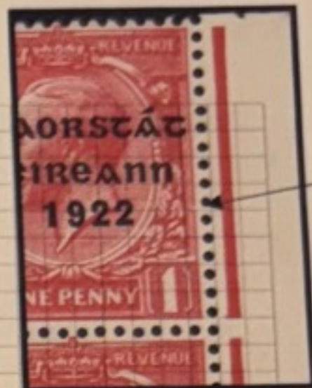
T48 R19/12 Frame break