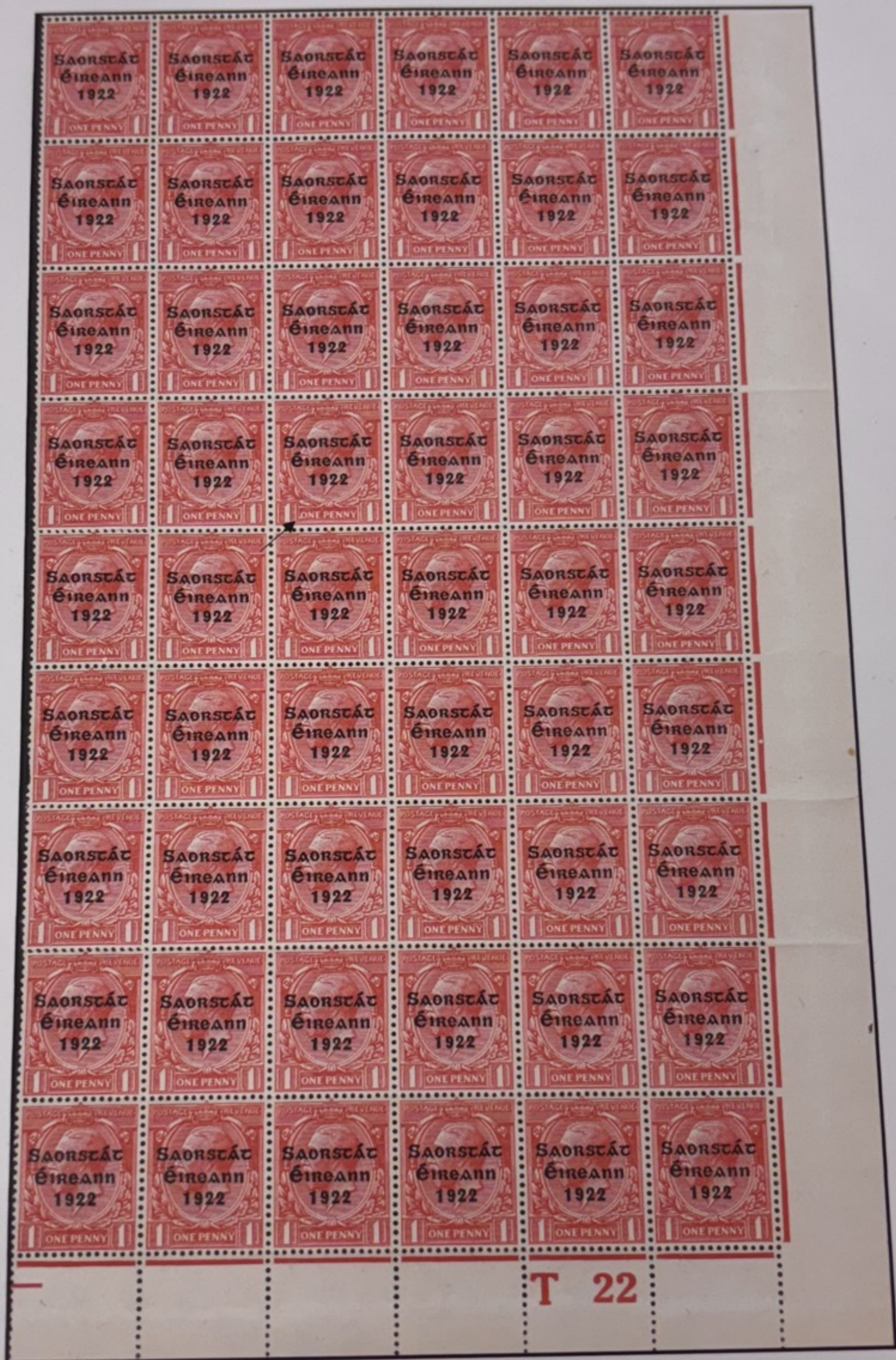
TC140 T48 T22 Perforate - Printer's Plate 96 Ptg. A, Overprint Setting 1 Variant Reversed 'Q' for 'O' stamp 9 from row 15 (R15/9)