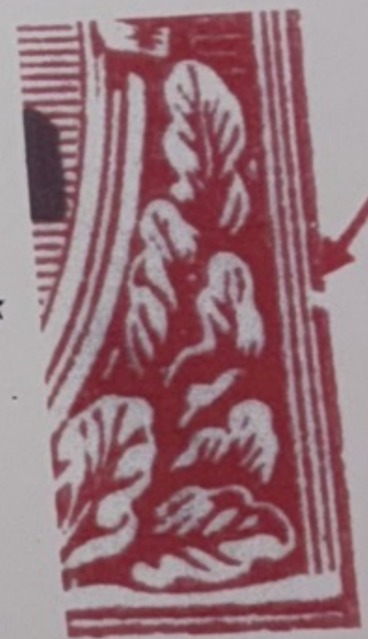
R19/12 Frame Break