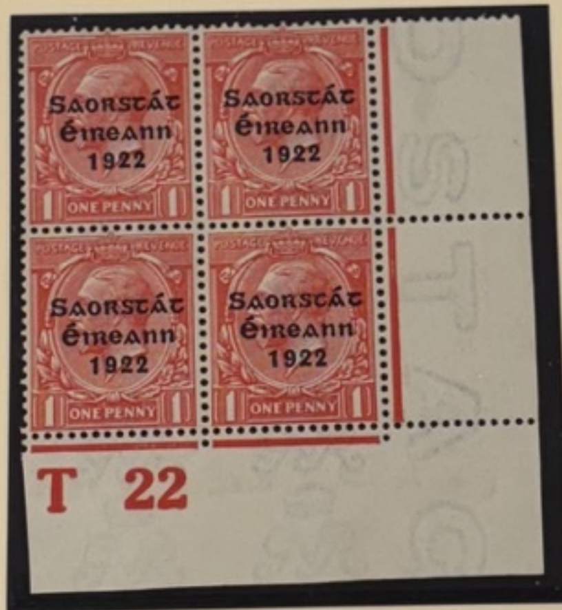
CONTROL BLOCK FEATURES and VARIETIES 'POSTAGE' watermark misplaced