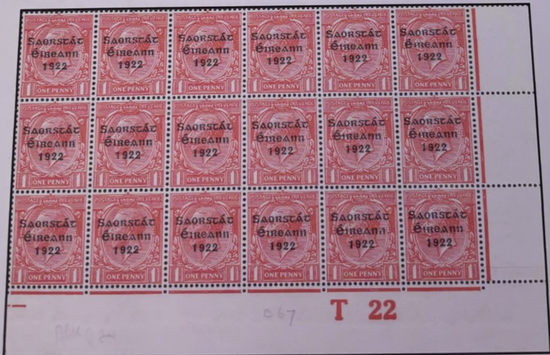
PCT184 T48DB T22 Imperforate Printer's Plate 94, Overprint Setting 1