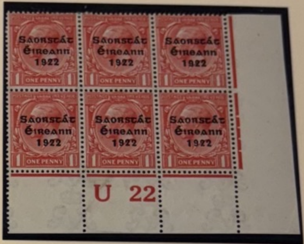
CONTROL BLOCK FEATURES and VARIETIES Distinctive marks in jubilee line adjacent to Row 20