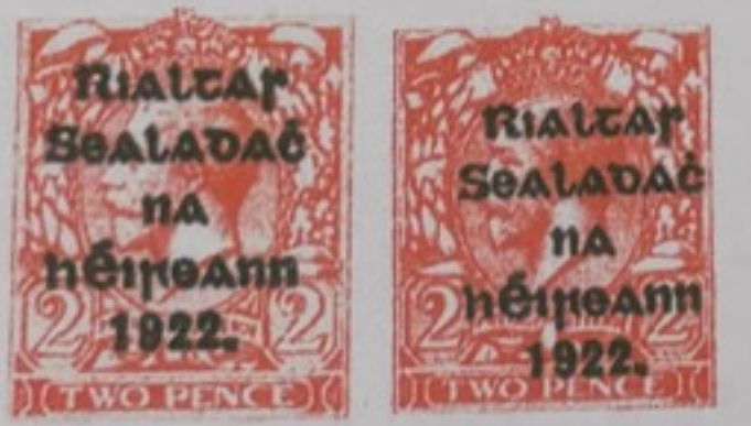
fig 1 fig 2

The late Cyril Dulin identified two types which he called Type A (fig 1) with central position and Type B (fig 2) with offset position and the final 2 of the control bisected by the perforations.