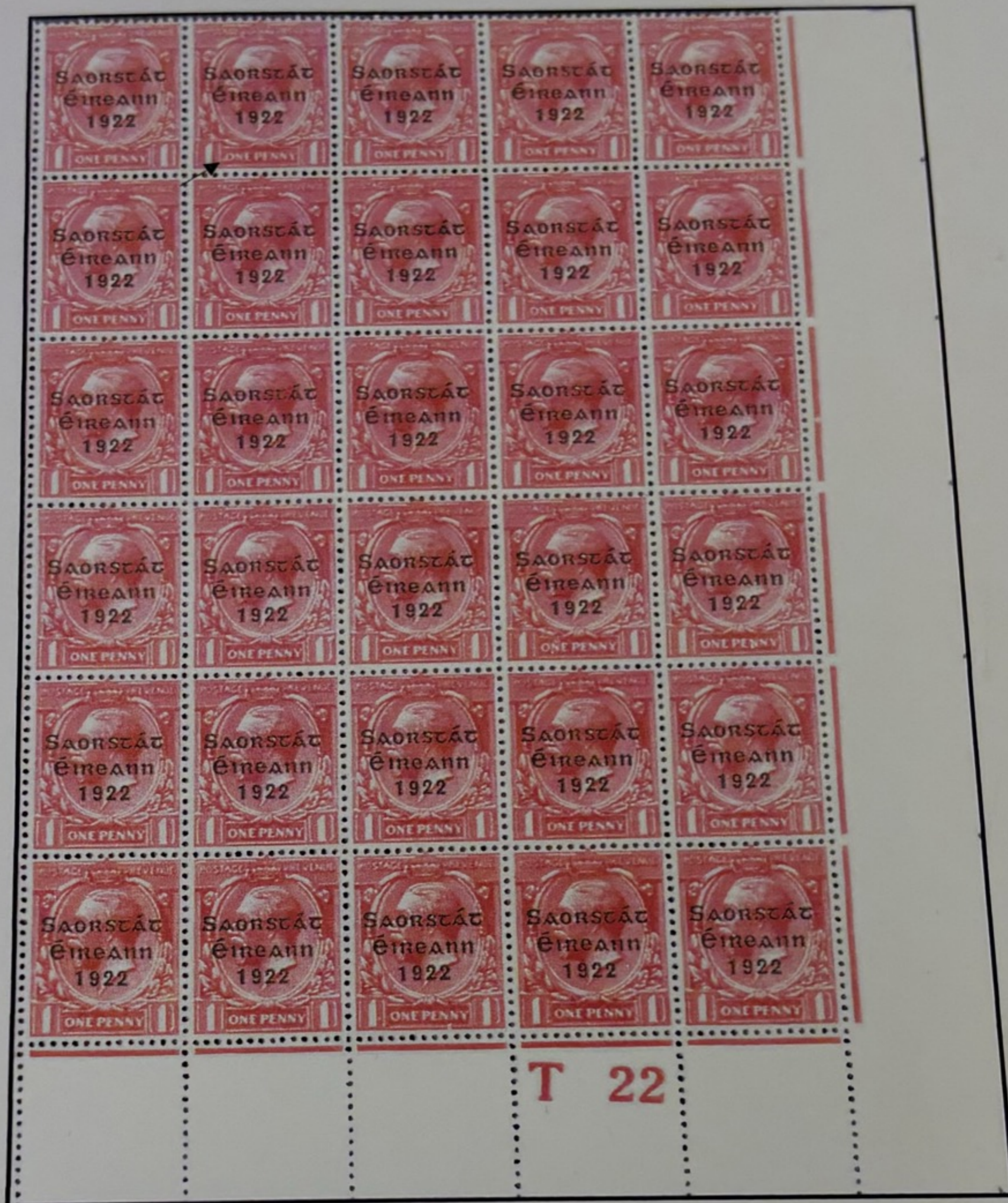
TC140 T48 T22 Perforate - Printer's Plate 96 Ptg. B, Overprint Setting 1 Variant Reversed 'Q' for 'O' stamp 9 from row 15 (R15/9) Image taken from Dulin's book and not true to colour