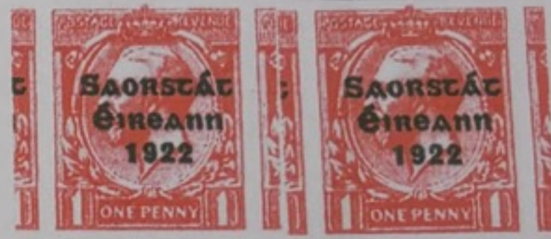
T 22 T 22

Differences also occur on the 1d value, plate 96. The 1d value is a difficult plate generally because of the odd and unexplained position of the Control number). Plate 96 has many flaws. Those that concern a standard Control block are a bevelled rule under R20/12 and the frame break (noted on Control T22) R19/12. Examples of different Control positions are shown in figs 4 and 5 below. Remove the flaws and rule identification from both values and it would be impossible to determine from which plates they are – truly Unidentifiable Plates?