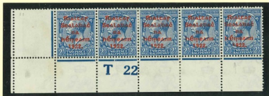
CONTROL BLOCK FEATURES and VARIETIES (fm)

Full stamp width perforation in left margin