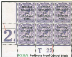
3d Dull Violet with Dull Black Overprint T31X. Proof Reference PR17