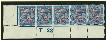
CONTROL BLOCK FEATURES and VARIETIES (fm)