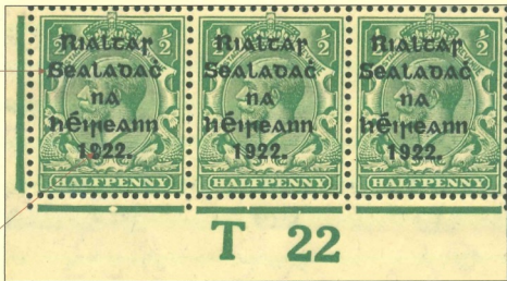
STAMP R20/1 VARIETIES