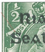
Row 20/1 UF6q - Nick in 's'