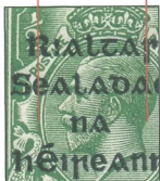
Row 19/4 V6c - 'R' over 'e'