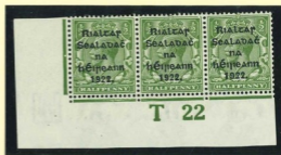
CONTROL BLOCK FEATURES and VARIETIES 'POSTAGE' watermark misplaced