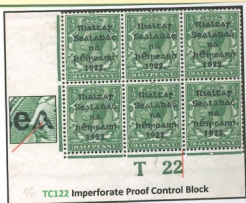
TC122 Imperforate Proof Control Block

'P' of 'POSTAGE' watermark in left margin adjacent to stamp R19/1