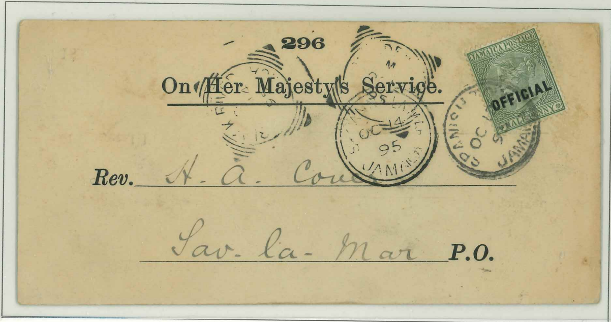
1/2d official stamp on OHMS printed card from Spanish Town. Spanish Town double-ring 12th October 1895, and Savannah-La-Mar double-ring receiver 14th October. Transit squared circle handstamps from Black River and [indistinct].

DUPLICATE REGISTER No. 1 of _____ of _____ Marriage solemnized by you in Westmoreland duly received