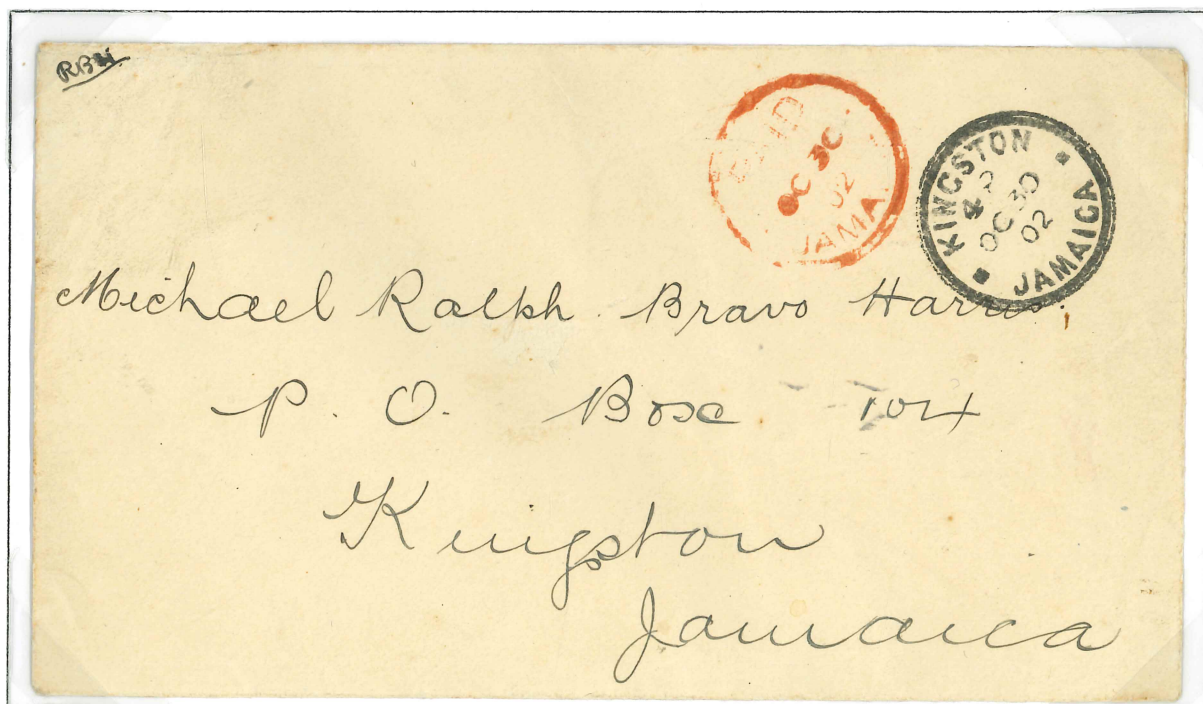
October 30th 1902 double-circle paid mark in red, with Kingston datestamp. This does not coincide with a known shortage. Given that the letter was submitted over the counter at Kingston for collection from a P.O. Box, it may indeed have been normal procedure to not waste an adhesive.