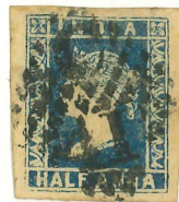
"C / 41" Cancellation