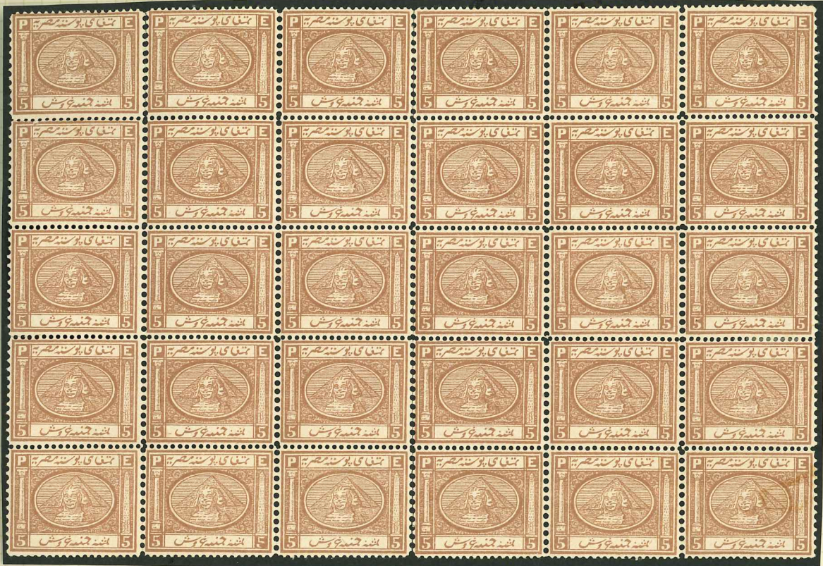
MINT BLOCK OF THIRTY.

WITH THE CORRECT PERFORATION 15 X 12 1/2.