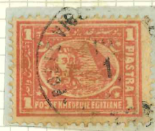
1872 STAMP GENUINE CANCELLATION FORGED.