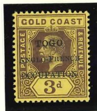
Mi.5x / SG.H38 purple on yellow