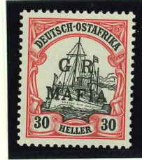
Mi.6a / SG.M6A