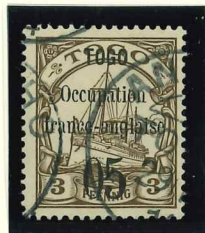
Mi.1 / Yvert.23c lines 3½ mm apart overprint: Type IV