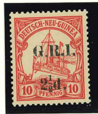
Mi.51 / SG.5 (27 February 1915)