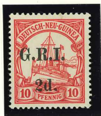
Mi.3 II / SG.18 (16 December 1914)