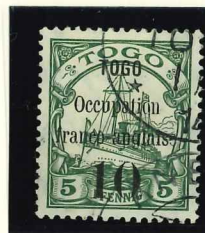
Mi.2 / Yvert.24a lines 3½ mm apart overprint: Type II