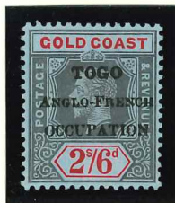
Mi.21 / SG.H55