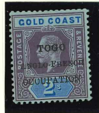
Mi.8 / SG.H42