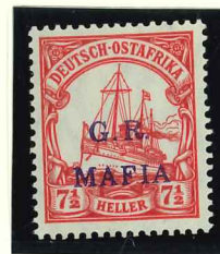
Mi.3b / SG.M3C