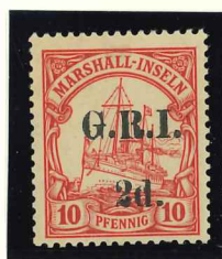
Mi.31 / SG.52