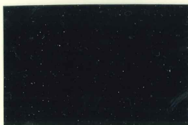
Mi.12 III / SG.24 chocolate-brown

On Bradbury, Wilkinson & Co. printing (1919)