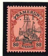
Mi.9 / SG.B9