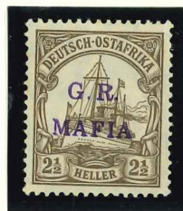
Mi.1b / SG.M1C