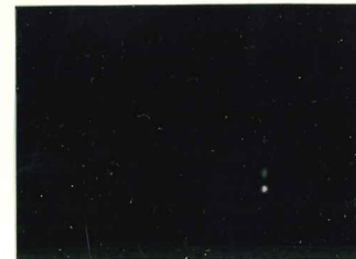
Mi.12 II / SG.H25