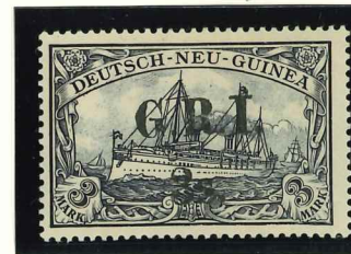
Mi.141 / SG.14 (17 October 1914)