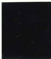
Mi.5 II / SG.H18