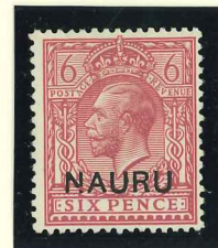
Mi.9 / SG.10 purple