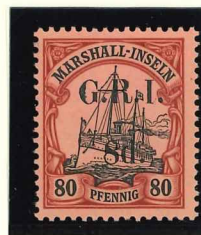
Mi.91 / SG.58