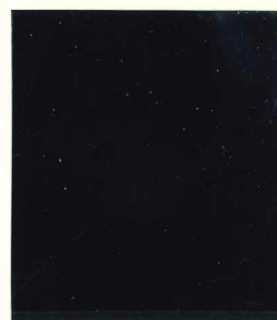
Mi.22 / SG.M42