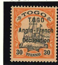
Mi.61 / SG.H6