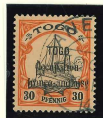
Mi.5 lines 2 mm apart