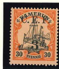
Mi.6 / SG.B6