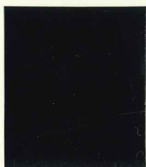
Mi.1 II PF I / SG.64cc (variety of Mi.1 II) straight serif to "1"