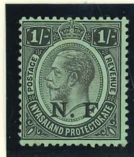
Mi.37 / SG.N5