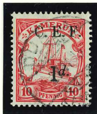
Mi.3b / SG.B3e black overprint