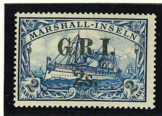
Mi.111 / SG.60