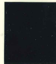
Mi.46y / SG.54a emerald back (1921)