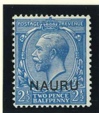
Mi.5 / SG.6 blue