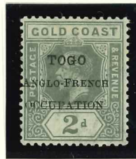
Mi.3 / SG.H36