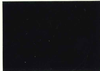
Mi.9b / SG.M9C