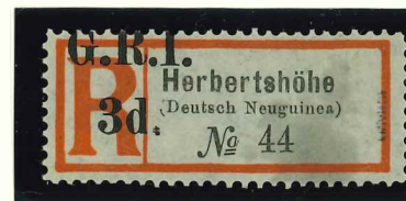
Mi.16c / SG.36 Herbertshöhe