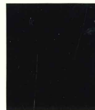
SG.H57a green/red on blue-green olive back (1920)