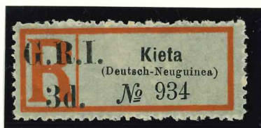
Mi.16e / SG.38 Kieta Ki Lian BPP