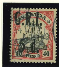
Mi.7 / SG.107