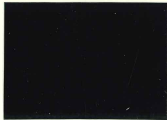
Mi.12 II / SG.64p