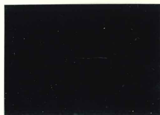
Mi.10 II / SG.64n