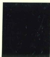
Mi.61 / SG.72

1922. Stamps of British East Africa and Uganda Protectorates (Mi.60 & Mi.63) overprinted "D.O.A." in red or black. Typo. Perf. K14. Watermark 2.