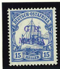
Mi.4b / SG.M4C