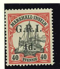
Mi.71 / SG.56