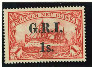
Mi.121 / SG.12 (17 October 1914)