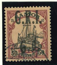
Mi.8 PF I / SG.108b (variety of Mi.8) inverted "9" for "6"