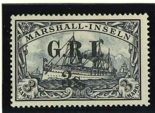
Mi.121 / SG.61