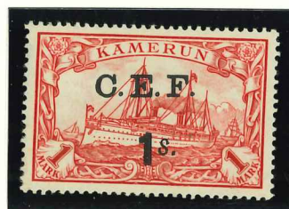
Mi.10 / SG.B10