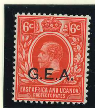
Mi.40 / SG.48 (October 1917)