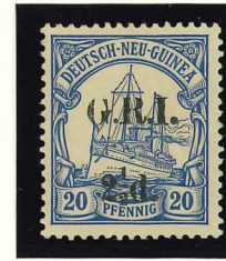
Mi.61 / SG.6 (27 February 1915)