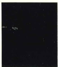
Mi.8 II / SG.23 (16 December 1914)