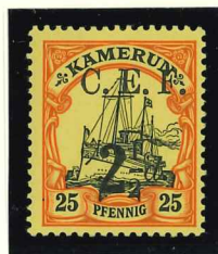
Mi.5 / SG.B5