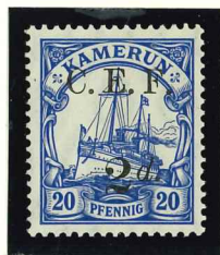
Mi.4 / SG.B4