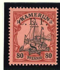
Mi.9 / SG.B9