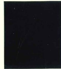
Mi.1 / Yvert.23d lines 3½ mm apart overprint: Type V