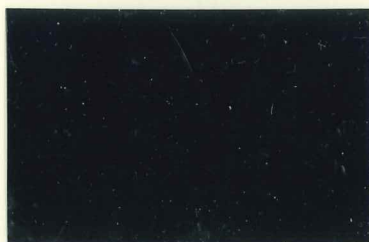
Mi.13 I / SG.17 rose-carmine

On Waterlow Bros. & Layton printing (1916)