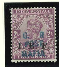
Mi.16 / SG.M36