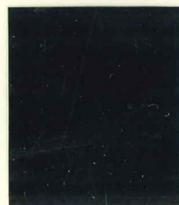
Mi.3 II / SG.15 red-brown