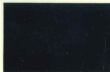
Mi.14 II / SG.23d deep bright blue

On Bradbury, Wilkinson & Co. printing (1919)