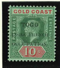
Mi.11 / SG.H45