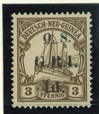
Mi.1 / SG.01

1915, 27 February. Stamps of German New Guinea (Mi.7–8) overprinted "O.S. / G.R.I." and surcharged in black. Typo. (10×10), Perf. K14:14½.