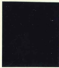
Mi.1 / SG.01a (variety of SG.01) "1" and "d" wider apart