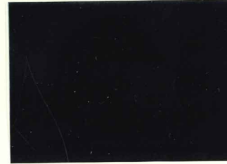
Mi.10a / SG.M10A