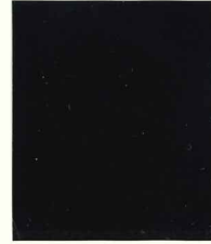
SG.H53c black on emerald-green emerald-green back (1920)