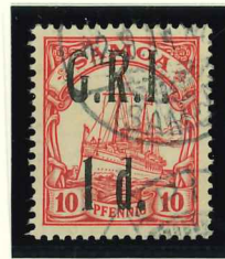
Mi.3 / SG.103