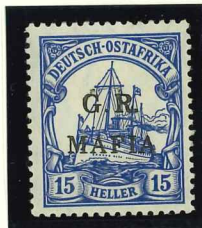
Mi.4a / SG.M4A