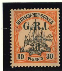
Mi.81 / SG.8 (17 October 1914)