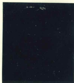
Mi.47y / SG.55a emerald back (1919)