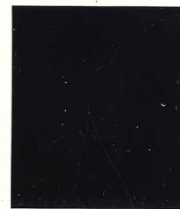
Mi.21 / SG.H33