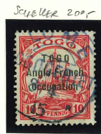
Mi.18 / SG.H31