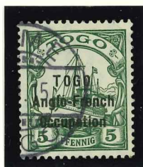
Mi.18 var narrow "Togo"; narrow "O's" in Togo & Occupation