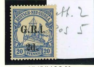
Mi.15 II / SG.30 (16 December 1914)