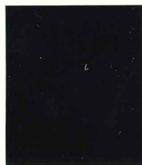
Mi.19 / SG.H32