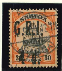
Mi.6 / SG.106 Scheller 200.-