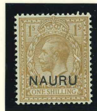
Mi.11 / SG.12 bistre-brown

With overprint (12,5 mm long) at foot (1923)