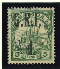
Mi.2 / SG.102