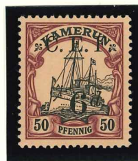
Mi.8 / SG.B8