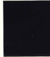
Mi.7b / SG.M7C