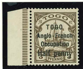
Mi.14 II PFI / SG.H27b (variety of Mi.14 II) small "y" in "Penny"