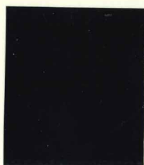
Mi.7 II / SG.64k