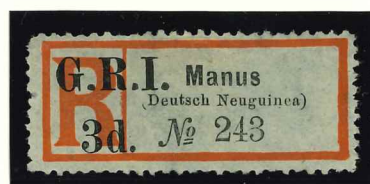
Mi.16fl / SG.39 Manaus BPP