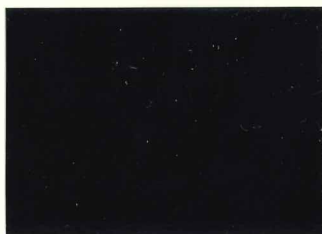
Mi.8a / SG.M8A