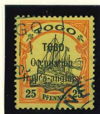
Mi.4 lines 2 mm apart