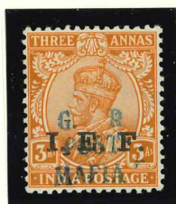
Mi.18 / SG.M38