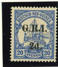
Mi.4 II / SG.19 (16 December 1914)