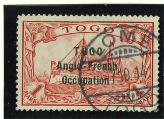
Mi.10 II / SG.H23