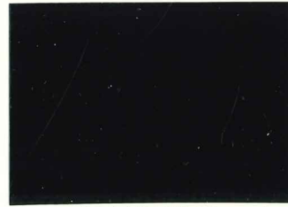
Mi.13 II / SG.28 (16 December 1914)