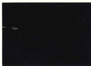
Mi.101 / SG.H10