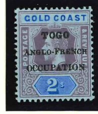
Mi.20 / SG.H54