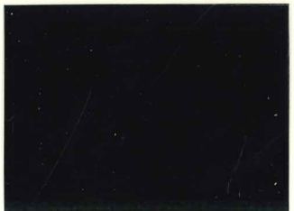
Mi.11 II / SG.64o