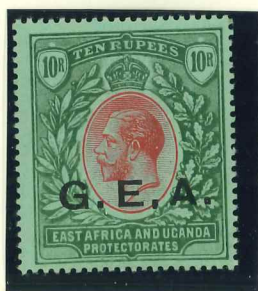
Mi.52x / SG.60 pale green back (October 1917)