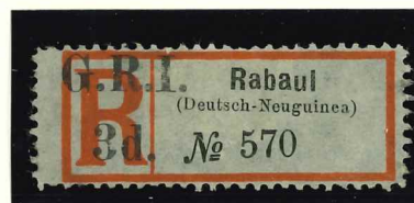
Mi.16g / SG.33d Rabaul (variety of SG.33) dash in "Deutsch-Neuguinea"