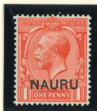
Mi.2 I / SG.2 bright scarlet