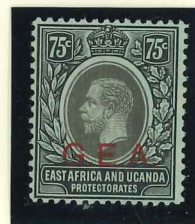
Mi.46x / SG.54 olive back (October 1917)