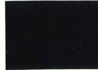
Mi.151 / SG.15 (17 October 1914)