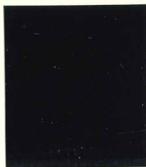
SG.16c (variety of SG.16) straight serif to "1" (16 December 1914)