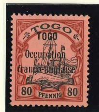
Mi.7 I (variety of Mi.7) lines 3½ mm apart