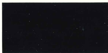
Mi.16a / SG.34 Deulon