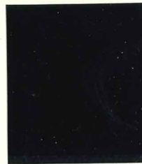
Mi.2 II / SG.17 slanting serif to "1" (16 December 1914)