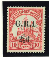
Mi.5 II / SG.20 (27 February 1915)