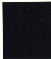
Mi.3 II / SG.H16