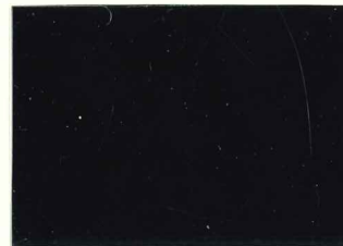
Mi.111 / SG.H11