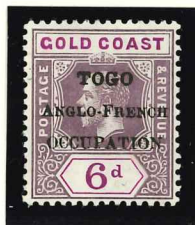
Mi.18 / SG.H52