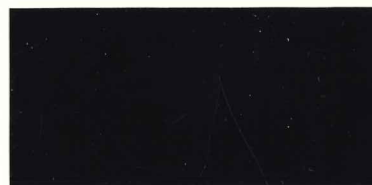
Mi.16h / SG.40 Stephansort