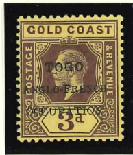
Mi.5y / SG.H38g purple on yellow white back