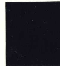
Mi.91 / SG.H9