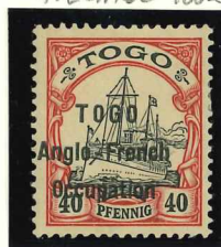
Mi.71 / SG.H7