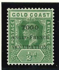
Mi.1 / SG.H34