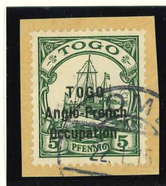
Mi.18 var narrow "Togo"; narrow "O's" in Togo & Occupation; "r" in line with "t"