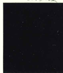
Mi.81 / SG.57