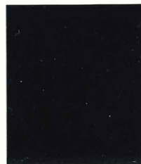
Mi.B15 / SG.32