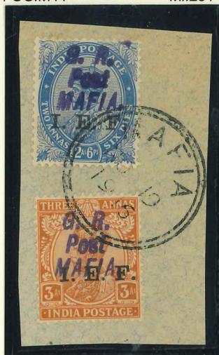
Mi.27 / SG.M47 & Mi.28 / SG.M48