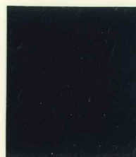
Mi.38b / SG.45b vermilion overprint (October 1917)