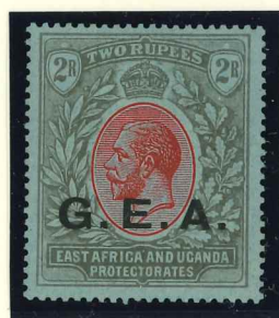
Mi.58 / SG.66