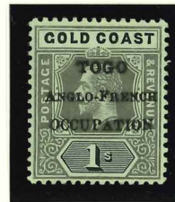
SG.H53a black on blue-green olive back (1918)