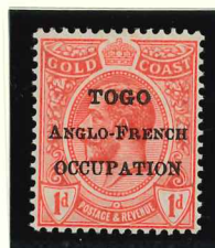
Mi.14 / SG.H48