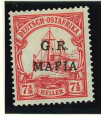
Mi.3a / SG.M3A