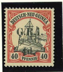
Mi.9 II / SG.24 (16 December 1914)