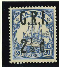
Mi.4 PF II / SG.104a (variety of Mi.4) no fraction bar in "1/2"