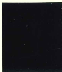
Mi.11 PF I / SG.50c (variety of Mi.11) straight serif to "1"