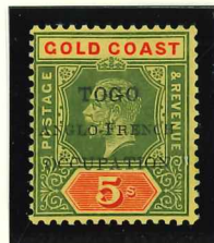
Mi.10 / SG.H44