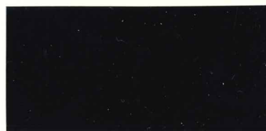
Mi.16dl / SG.37 Käwieng