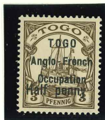
Mi.14 I / SG.H12