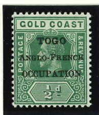
Mi.13 / SG.H47

1916, 15 April/1920. Stamps of Gold Coast (Mi.62-73) with black overprint ("London issue" - with thicker overprint, "OCCUPATION" 15 mm long). Typo. Perf. 14. Watermark 2.