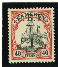
Mi.7 / SG.B7