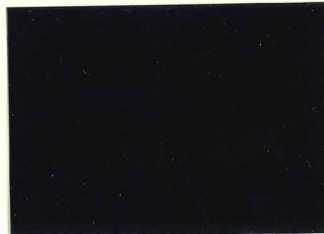
Mi.9a / SG.M9A