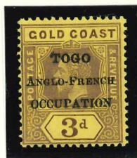
Mi.17 / SG.H51 purple on yellow