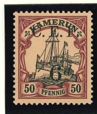
Mi.8 / SG.B8