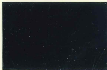
Mi.14 I / SG.18 indigo-blue