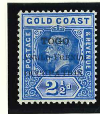
Mi.4 / SG.H37