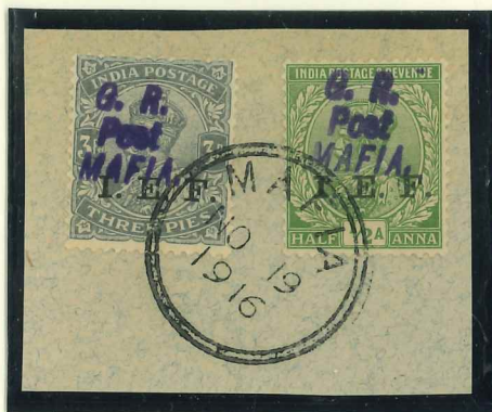
Mi.23 / SG.M43 & Mi.24 / SG.M44