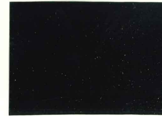
Mi.13 II / SG.H26