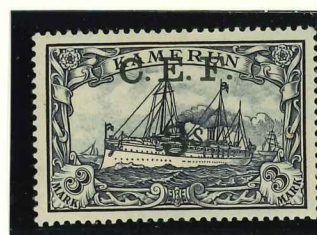
Mi.12 / SG.B12