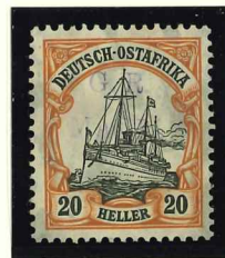
Mi.5b / SG.M5C