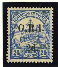
Mi.41 / SG.4 (17 October 1914)