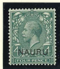
Mi.7 / SG.8 slate-green