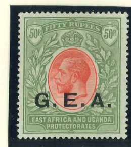
Mi.54 / SG.62 (October 1917)