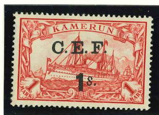
Mi.10 / SG.B10