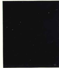
SG.H53b black on emerald-green olive back (1920)