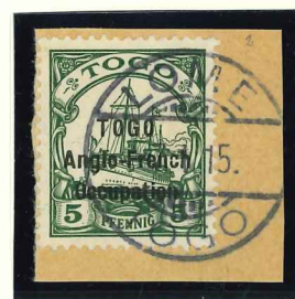
Mi.18 var first day cancellation; narrow "Togo"; narrow "O's" in Togo & Occupation