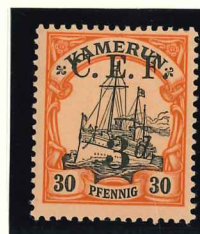
Mi.6 / SG.B6