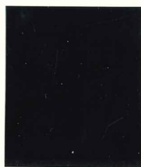
Mi.16 / SG.H29

1915, 7 January. Stamps of Togo (Mi.7, Mi.10, Mi.13-14 & Mi.21-22) with black overprint "TOGO / Anglo-French / Occupation" (Sansane-Mangu issue - with "Anglo-French 15 mm long). Typo. (10×10), Perf. K14:14½. Without watermark (Mi.16 & Mi.19-21) or Watermark 1 (Mi.17-18).