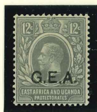
Mi.55 / SG.63