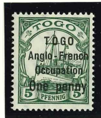
Mi.15 II / SG.H28