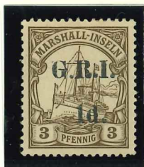
Mi.11 / SG.50 slanting serif to "1" Schaller

Type I: Lines 5 mm (Mi.11-91) or 3½-4½ mm (Mi.101-131) apart.