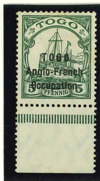
Mi.18 var narrow "O's" in Togo & Occupation; "T" in line with "l"