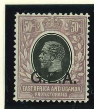
Mi.57 / SG.65