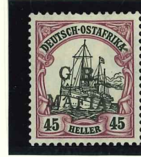
Mi.7a / SG.M7A