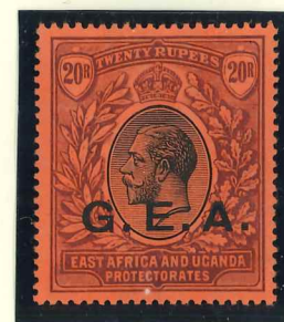
Mi.53 / SG.61 (October 1917)