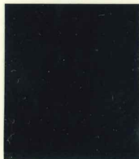
Mi.44y / SG.52a pale yellow paper (1921)