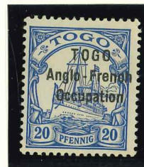
Mi.4 II / SG.H17