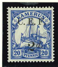
Mi.4 / SG.B4