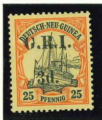
Mi.71 / SG.7 (17 October 1914)