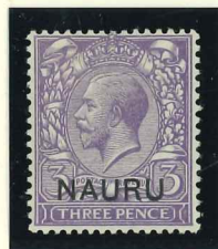
Mi.6 / SG.7 bluish violet