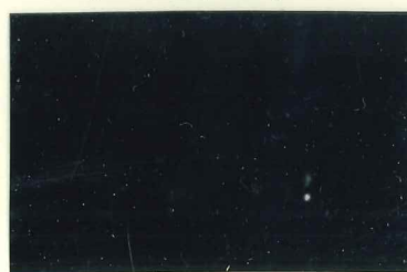
Mi.12 III / SG.25 pale brown