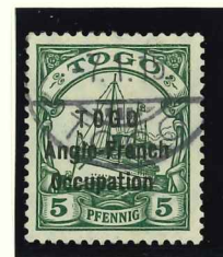
Mi.18 first day cancellation; narrow "O's" in Togo & Occupation; "r" in line with "t"