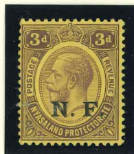
Mi.35 / SG.N3