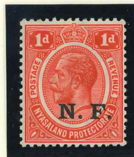
Mi.34 / SG.N2