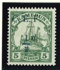
Mi.2 / SG.B2