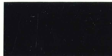
Mi.16fll / SG.43 Manaus