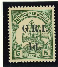
Mi.21 / SG.2 slanting serif to "1" (17 October 1914)