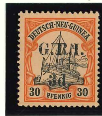
Mi.91 / SG.9 (17 October 1914)