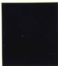
SG.1c (variety of SG.1) straight serif to "1" (17 October 1914)