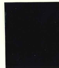
Mi.21 / SG.M41