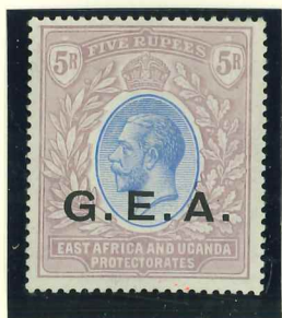
Mi.51 / SG.59 (October 1917)