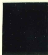
Mi.62 / SG.73