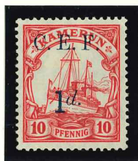
Mi.3a / SG.B3 blue overprint