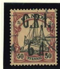
Mi.8 / SG.108 Scheller