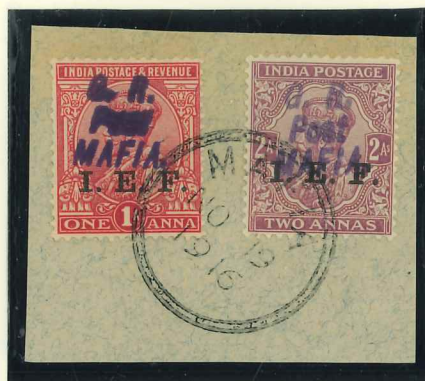
Mi.25 / SG.M45 & Mi.26 / SG.M46