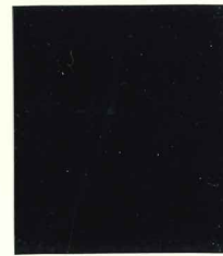
Mi.11 II / SG.26 (16 December 1914)