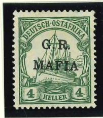
Mi.2a / SG.M2A