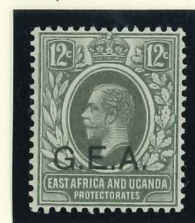
Mi.42 / SG.50 (October 1917)