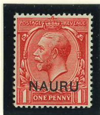
Mi.2 I / SG.2c carmine-red