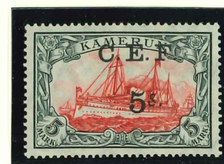
Mi.13 / SG.B13b (variety of SG.B13) "s" broken at top