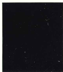
Mi.2 II / SG.H15