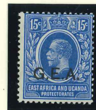
Mi.43 / SG.51 (October 1917)