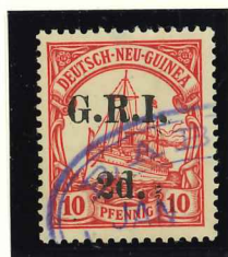
Mi.31 / SG.3 (17 October 1914)