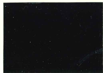
Mi.11 II / SG.H24