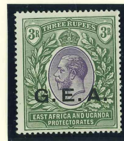
Mi.49 / SG.57 (October 1917)