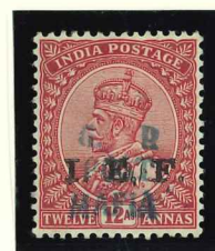
Mi.20 / SG.M40