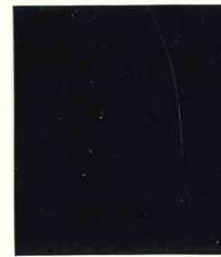
Mi.101 / SG.10 (17 October 1914)