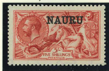
Mi.13 II / SG.22 bright carmine