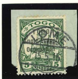
Mi.18 var narrow "O's" in Togo & Occupation