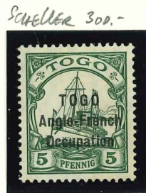
Mi.17 / SG.H30