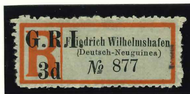
Mi.16bll / SG.41b Fr. Wilhelmshafen (variety of SG.41) no stop after "d"