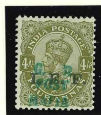
Mi.19 / SG.M39