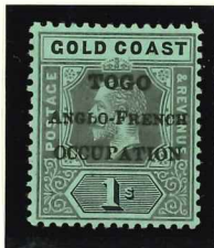
Mi.19 / SG.H53 black on green