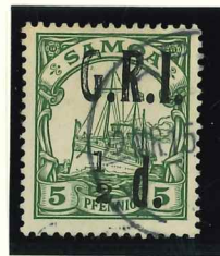
Mi.2 PF III / SG.102e (variety of Mi.2) "1" to left of "2" in "1/2"