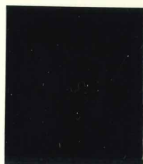
Mi.1 II / SG.64c slanting serif to "1"

Type II: Lines 6 mm (Mi.11I-9II) or 5½ mm (Mi.10II-13II) apart.