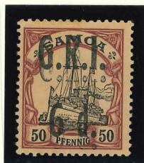
Mi.8 DD / SG.108a (variety of Mi.8) double overprint