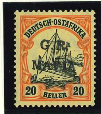
Mi.5a / SG.M5A