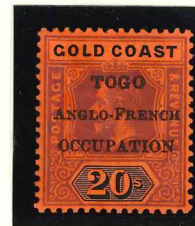
Mi.24 / SG.H58