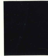
Mi.111 / SG.11 (17 October 1914)