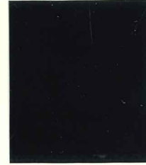
Mi.1 / Yvert.23e lines 3½ mm apart overprint: Type VI