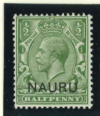
Mi.1 I / SG.1 yellow-green

With overprint (12,5 mm long) at foot (1916)