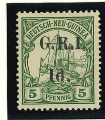
SG.17c (variety of SG.17) straight serif to "1" (16 December 1914)