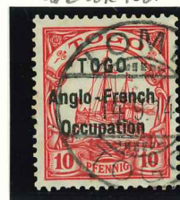
Mi.31 / SG.H3