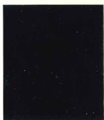
Mi.7 II / SG.22 (16 December 1914)