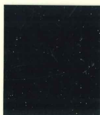
Mi.1 II / SG.13 green

With overprint (13,5 mm long) at centre (1923)