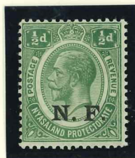
Mi.33 / SG.N1