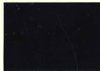
Mi.10 II / SG.111 "Shilling"