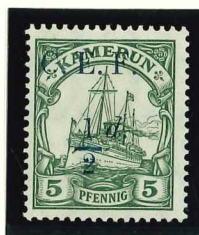
Mi.2 / SG.B2