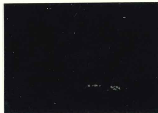
Mi.8b / SG.M8C