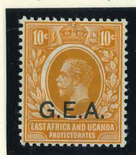
Mi.41 / SG.49 (October 1917)