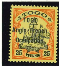
Mi.51 / SG.H5