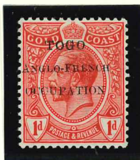
Mi.2 / SG.H35