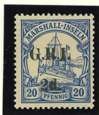
Mi.41 / SG.53