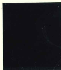
Mi.2 II / SG.64d slanting serif to "1"