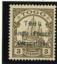
Mi.11 / SG.H1