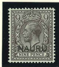
Mi.10 / SG.11 agate