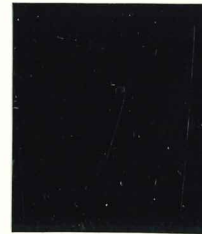
Mi.8 II / SG.H21