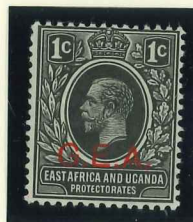
Mi.38a / SG.45 red overprint (October 1917)