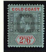
Mi.9 / SG.H43