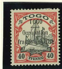
Mi.6 I (variety of Mi.6) lines 3½ mm apart