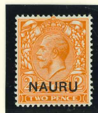
Mi.4 I / SG.5 orange

With overprint (13,5 mm long) at centre (1923)