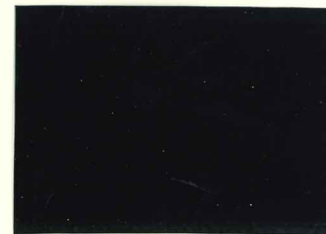
Mi.13 II / SG.64q