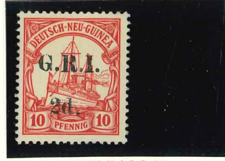
Mi.14 II / SG.29 (16 December 1914)