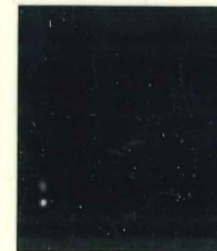
Mi.4 II / SG.16 orange