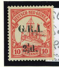
Mi.6 II / SG.21 (27 February 1915)