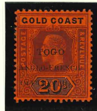
Mi.12 / SG.H46