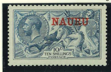
Mi.14 II / SG.23 pale blue