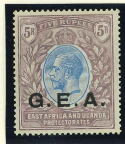
Mi.60 / SG.68