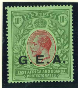
Mi.52y / SG.60a emerald back (October 1917)