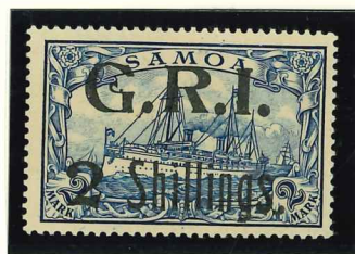
Mi.11 / SG.112