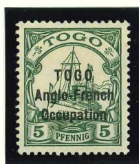
Mi.18 var wide "O's" in Togo & Occupation

Minor varieties of "TOGO / Anglo-French / Occupation" overprint. Study of Mi.17 (unused and cancelled) from "Sansane-Mangu issue".