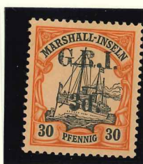
Mi.51 / SG.54