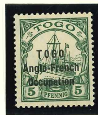
Mi.18 var narrow "O's" in Togo & Occupation