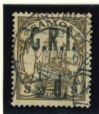
Mi.1 / SG.101

1914, 3 September. Stamps of Deutsch-Samoa (Mi.7-19) overprinted "G.R.I." and surcharged in black. Typo. (10×10), Perf. K14:14½ (Mi.1-9); Engr. (4×5), Perf. K14½ or K14¼ (Mi.10-13).