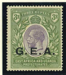
Mi.59 / SG.67