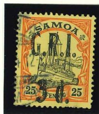
Mi.5 / SG.105