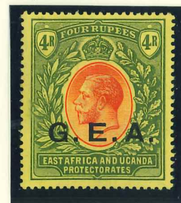
Mi.50 / SG.58 (October 1917)