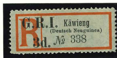
Mi.16dll / SG.42 Käwieng