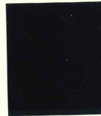
Mi.2 II PF I / SG.64dc (variety of Mi.2 II) straight serif to "1"