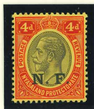
Mi.36 / SG.N4