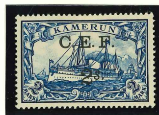
Mi.11 / SG.B11