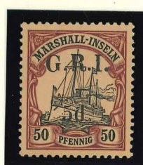
Mi.8 II / SG.64cl