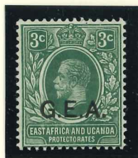
Mi.39 / SG.47 (October 1917)