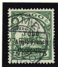
Mi.18 var wide "O's" in Togo & Occupation