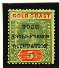
SG.H56a green/red on buff-yellow (1919)