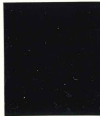
Mi.7 II / SG.H20