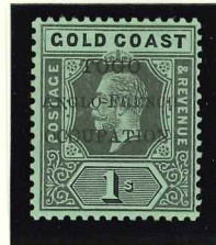
Mi.7 / SG.H41