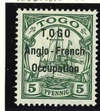
Mi.21 / SG.H2