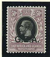
Mi.45 / SG.53 (October 1917)