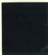
Mi.2 II / SG.14 scarlet