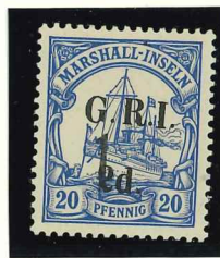
Mi. 15 / SG.64