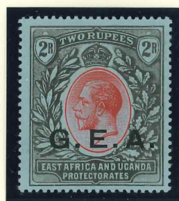
Mi.48 / SG.56 (October 1917)