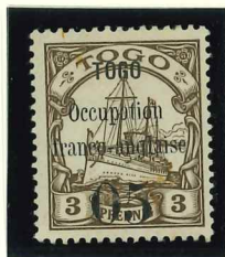
Mi.1 / Yvert.23a lines 3½ mm apart overprint: Type II