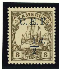
Mi.1 / SG.B1