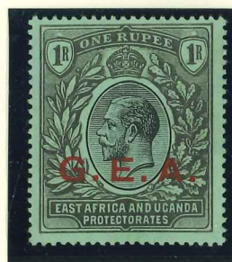
Mi.47x / SG.55 pale green back (October 1917)