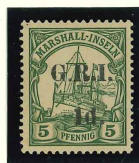
Mi.21 / SG.51 slanting serif to "1" Schaller