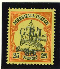
Mi.5 II / SG.64i