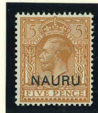
Mi.8 / SG.9 yellow-brown