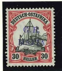
Mi.6b / SG.M6C