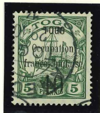
Mi.2 / Yvert.24 lines 3½ mm apart overprint: Type I