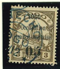
Mi.1 / Yvert.23b lines 3½ mm apart overprint: Type III