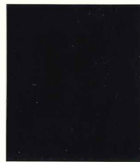
Mi.20 / SG.H32a