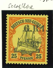
Mi.11 / SG.1 slanting serif to "1" (17-October 1914)

Type I: Lines 6 mm (Mi.11–11I) or 3½–4½ mm (Mi.12I–15I) apart.