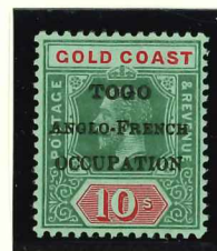
Mi.23 / SG.H57 green/red on green