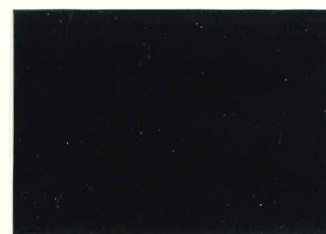
Mi.131 / SG.62