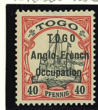
Mi.81 / SG.H8