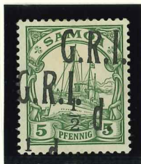
Mi.2 DD / SG.102d (variety of Mi.2) double overprint