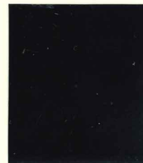
Mi.2 / Yvert.24b lines 3½ mm apart overprint: Type III