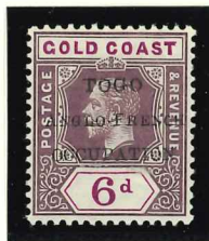
Mi.6 / SG.H40