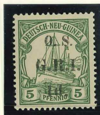
Mi.2 / SG.02