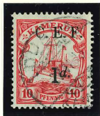
Mi.3b / SG.B3e black overprint