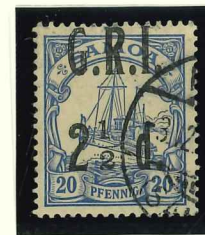
Mi.4 / SG.104