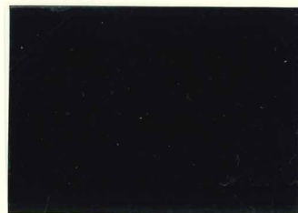
Mi.12 / SG.113