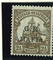
Mi.1a / SG.M1A

Black (Mi.2a-10a) or blackish lilac overprint (Mi.1a):