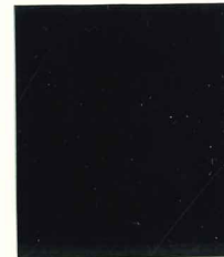
SG.2c (variety of SG.2) straight serif to "1" (17 October 1914)