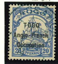
Mi.41 / SG.H4