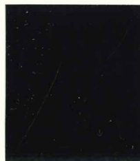
Mi.6 II / SG.H19