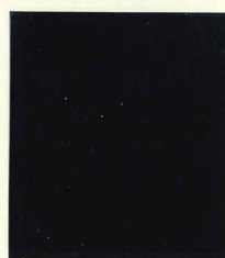
Mi.4 II / SG.64f