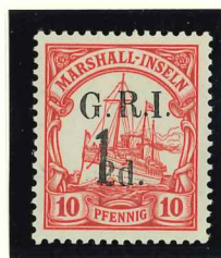
Mi. 14 / SG.63

1915, January. Australian occupation stamps of Marshall Islands (Mi.3–4) surcharged in black. Typo. (10×10), Perf. K14:14½.