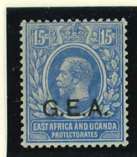
Mi.56 / SG.64