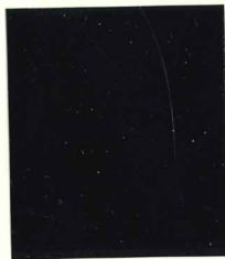
Mi.10 II / SG.25 (16 December 1914)