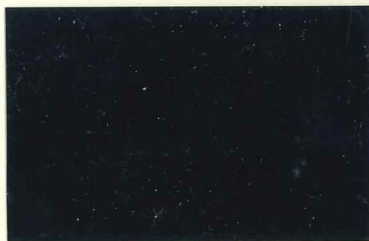
Mi.12 II / SG.19 sepia-brown