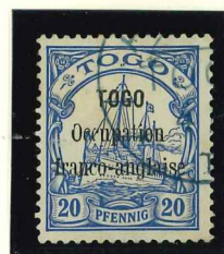
Mi.3 lines 2 mm apart