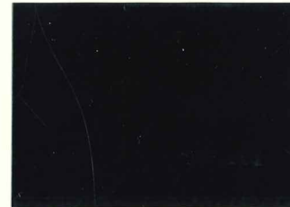
Mi.10b / SG.M10C