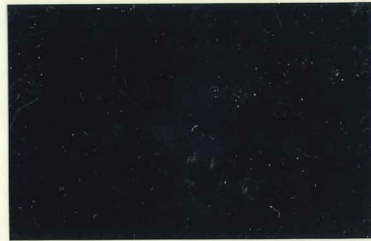
Mi.12 II / SG.20 yellow-brown