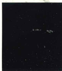
Mi.1 II / SG.H14