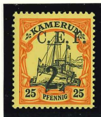
Mi.5 / SG.B5