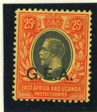
Mi.44x / SG.52 yellow paper (October 1917)