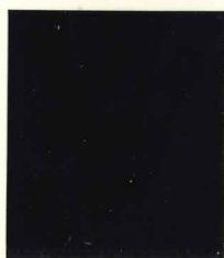
Mi.3 II / SG.64e