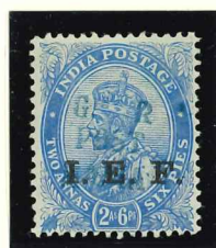
Mi.17 / SG.M37