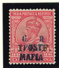
Mi.15 / SG.M35