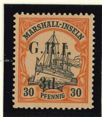
Mi.6 II / SG.64j