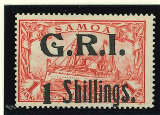
Mi.10 I / SG.110 "Shillings"