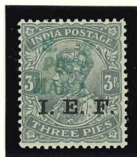
Mi.13 / SG.M33