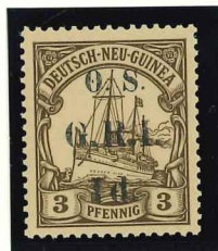
Mi.A15 / SG.31

1915, 1 January. Australian occupation stamps of German New Guinea (Mi.3II-4II) surcharged in black. Typo. (10×10), Perf. K14:14½.