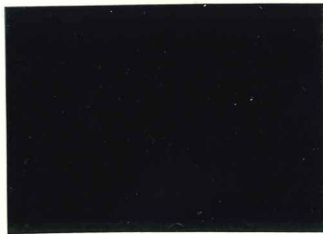
Mi.12 II / SG.27 (16 December 1914)