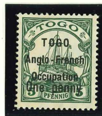
Mi.15 I / SG.H13