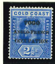
Mi.16 / SG.H50