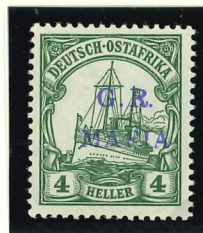
Mi.2b / SG.M2C