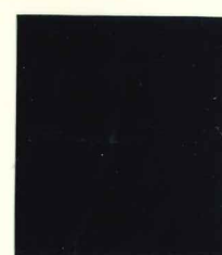
Mi.9 II / SG.64m