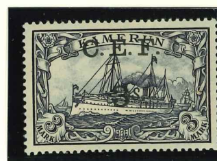
Mi.12 / SG.B12