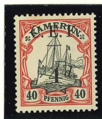
Mi.7 / SG.B7