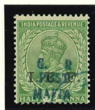
Mi.14 / SG.M34