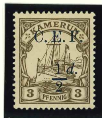
Mi.1 / SG.B1