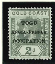
Mi.15 / SG.H49