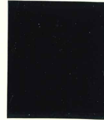
Mi.9 II / SG.H22