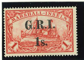
Mi.101 / SG.59