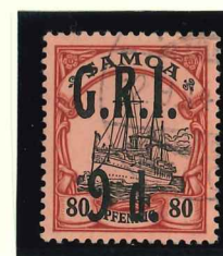
Mi.9 / SG.109 Scheller 200.-