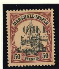
Mi.61 / SG.55