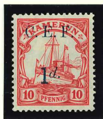
Mi.3a / SG.B3 blue overprint