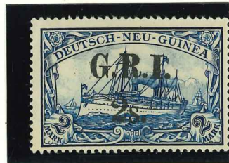
Mi.131 / SG.13 (17 October 1914)