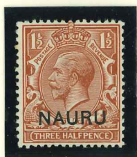
Mi.3 I / SG.3 red-brown

With overprint (12,5 mm long) at foot (1923)