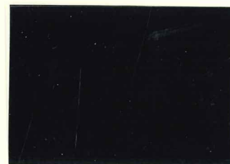
Mi.13 / SG.114