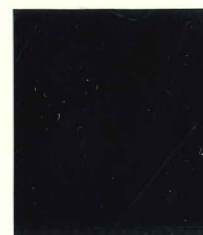
Mi.21 PF I / SG.51c (variety of Mi.21) straight serif to "1"