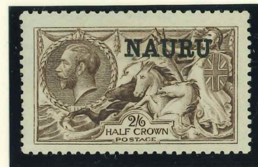
Mi.12 II / SG.21 brown