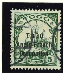
Mi.18 var wide "O's" in Togo & Occupation; "T" in line with "l"