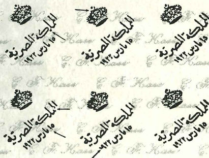
← The composition of the booklet forme of six subjects