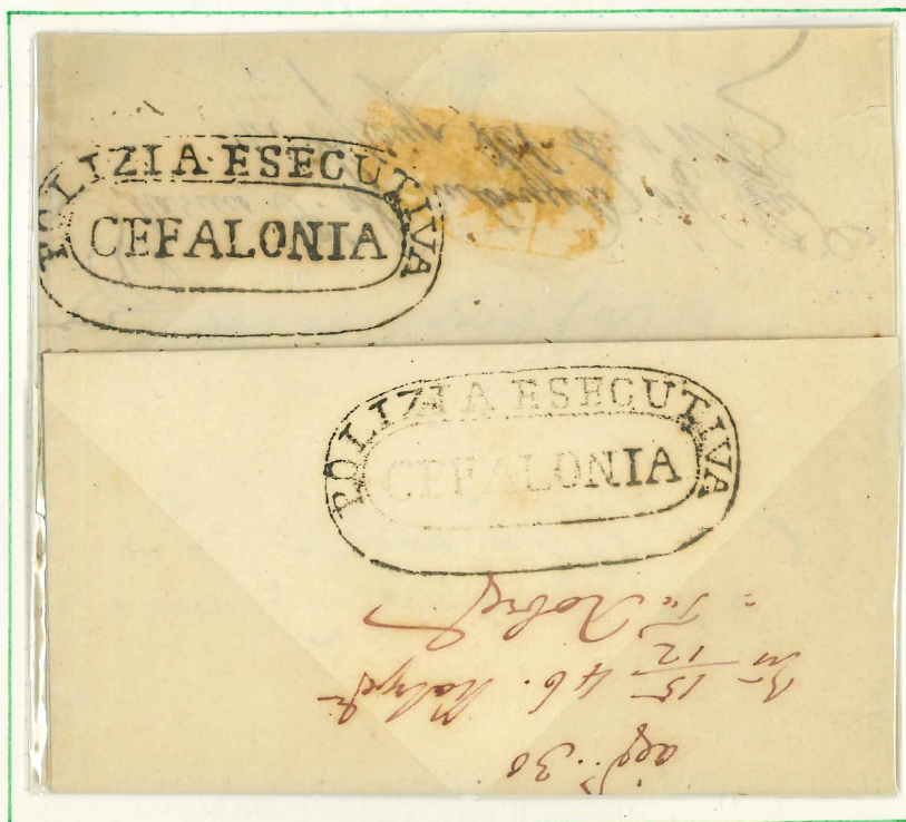
Two Cephalonia Police cachets on a censored document dated December 1846.