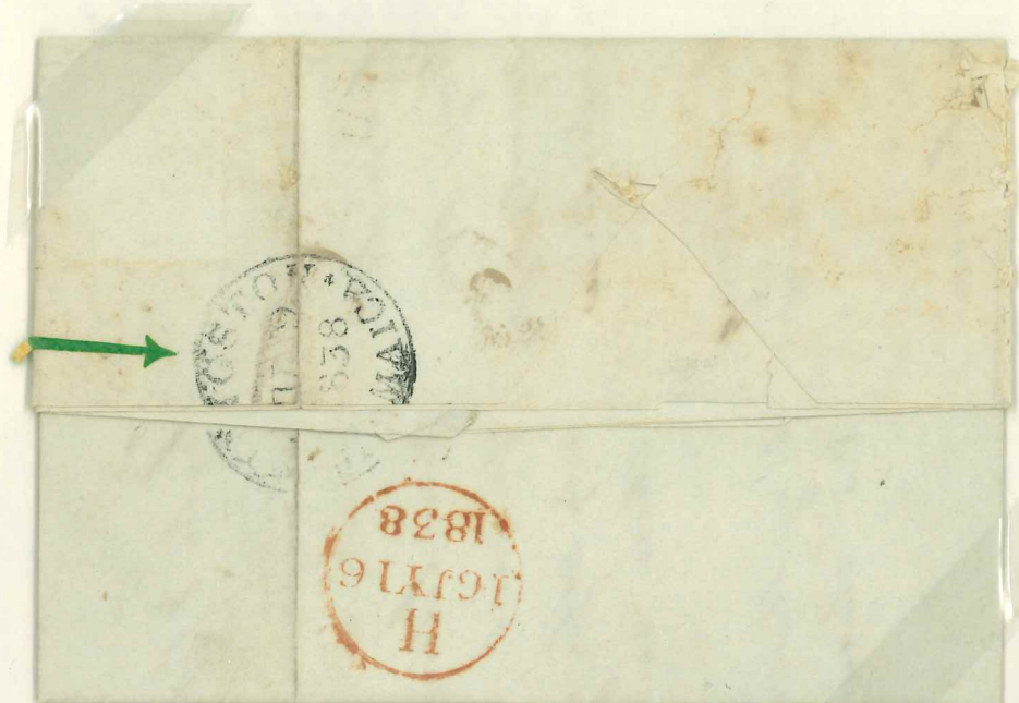
1838: KINGSTON (TYPE K4) TO LONDON, MANUSCRIPT MARK "2sh. 2p" the rate in effect then