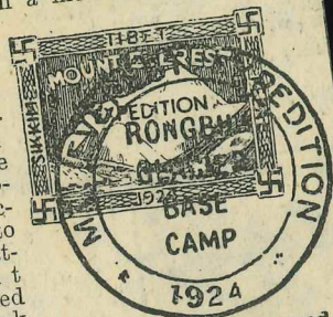
The Everest stamp and postmark.

also are two Indian half-anna stamps. Headed "Mount Everest Expedition, 1924; Leader, Gen. Hon. C. G. Bruce, C.B.," the postcard consists of a print of a photograph showing Mount Everest from the base camp in the Rongbuk Valley, Tibet, with the printed words "Dispatched by Postal Runner to India." Under this are the words "Best wishes" and the signature.