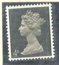
CB. PVA. 250 COIL