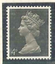
U11. FOREHEAD SCAR. CYL. 4 R. 20/8. TH. C2-3