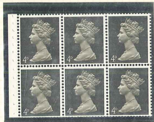
CB. PVA. A. HEAD. 250 2/2 SHOULDER FLAW