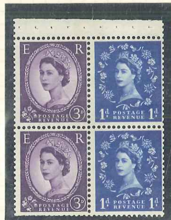
1d. 2B. 8mm : 3d. 1RB WMK. SIDE CROWN TO R