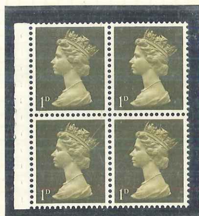
UB. 1. R1-2/1. VERTICAL DOTTED LINE THROUGH RT. EDGE