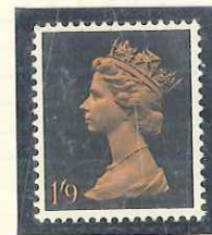
U30. VERTICAL FACE SCRATCH