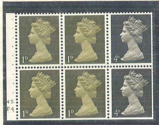
CB. PVA. B. HEAD. 250. PERF. J CYL PANE. 4d PAIR SHIFT TO R