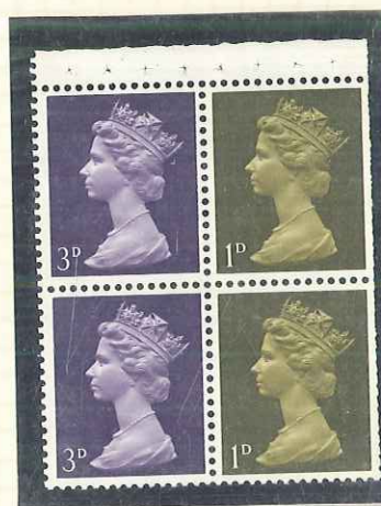
PERF. K 1d PAIR SHIFT DOWN