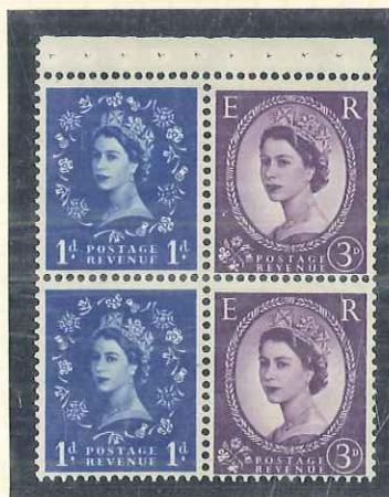
W. SIDE. CR. TO L. 1d SHIFT UP