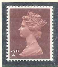
CB. GA. 250 II COIL