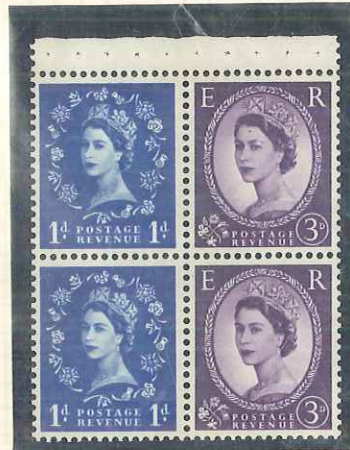
1d. 2B. 8mm : 3d. 1LB WMK. SIDE CROWN TO L