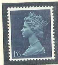
'ALL OVER' PVA