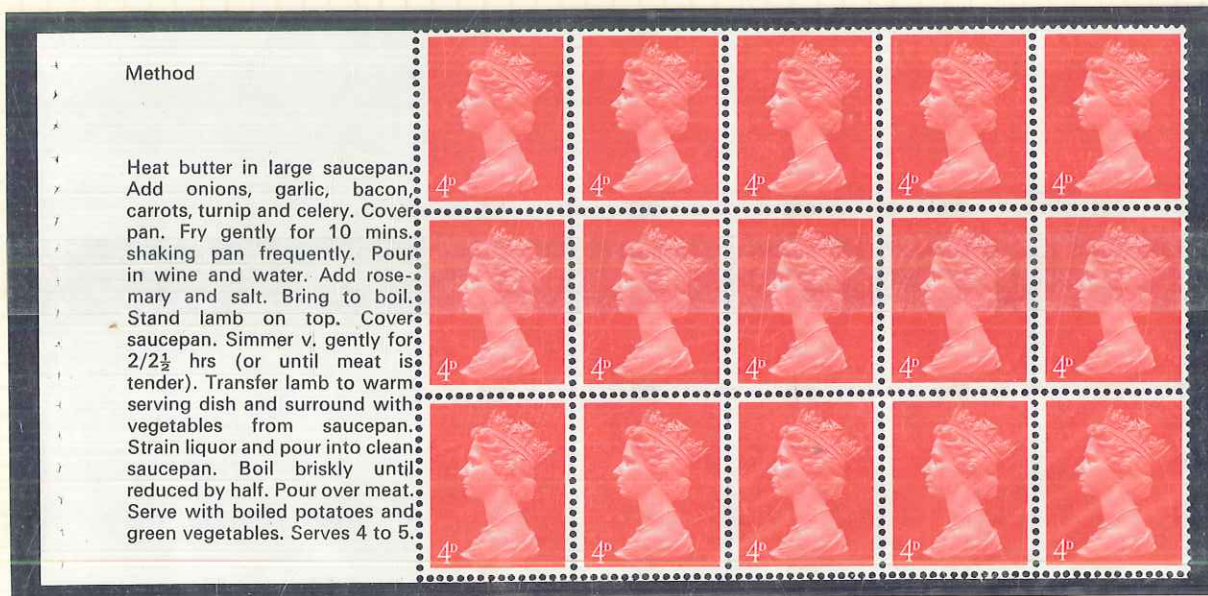
"METHOD" PANE. CB. VALUE LOW