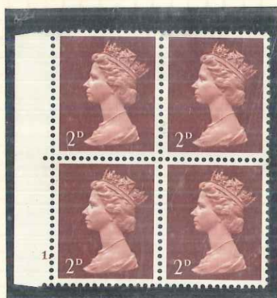
TYPE I. CYL. BLOCK