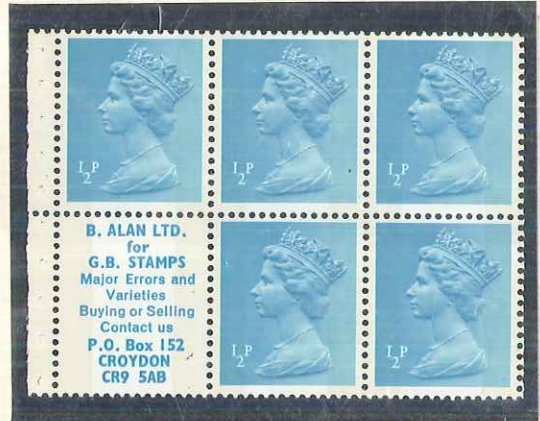
4/71. PERF. L.R