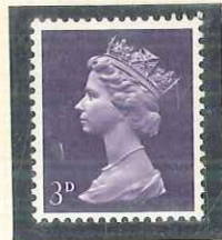
CB. PVA. 150