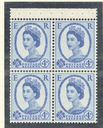
W. SIDE. CR. TO R.