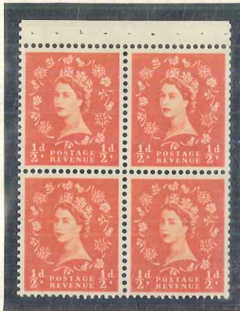
SB. 8. WMK. UPRIGHT