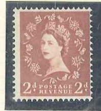
2 B. 8mm