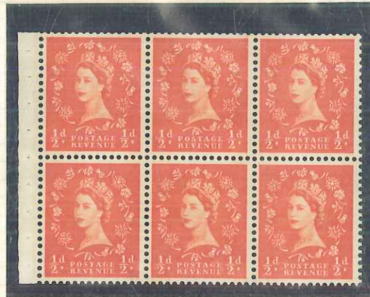
2B. 8mm BLUE P