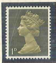
U2. W. FLAW Q'S HAIR. CYL. 4 R. 6/9. TH. B3