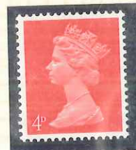
U15. GA. A