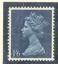
U28. BLUE OMITTED