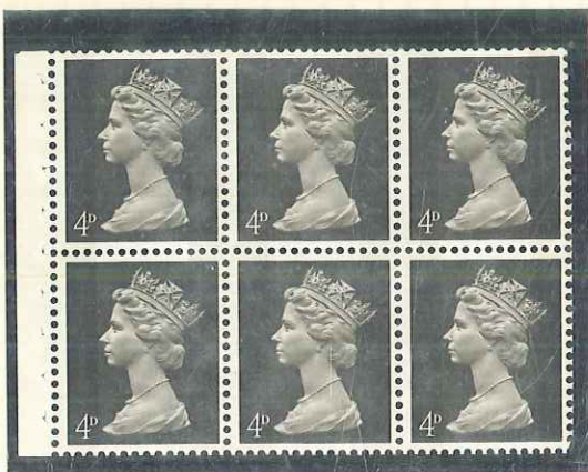
2 B. PVA. A. HEAD. 150 VERT. LINE OF GREY DOTS THROUGH MIDDLE PAIR