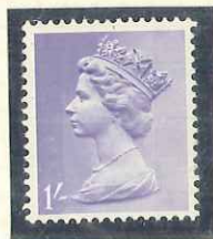
U25. MISSING PEARL