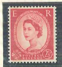
LB. 8mm II