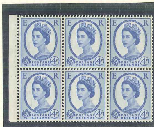
2 B. 8mm VIOLET P. WMK. INVERTED