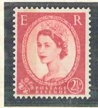
LB. 8mm I