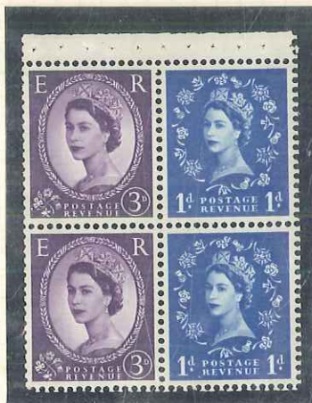
2B. 9.5mm WMK. SIDE CROWN TO R