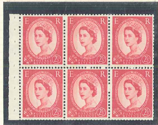
MISPLACED 1L. B. 4mm. BLUE P