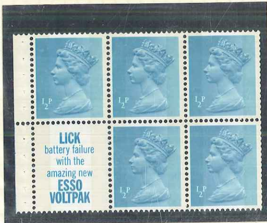
PERF. L.S. EXCESS INK DRIP IN CHIN 2/3. THROAT RETOUCH