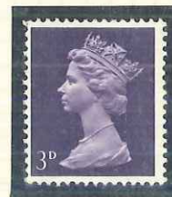
U10. SHOULDER RETOUCH. TH. G 4