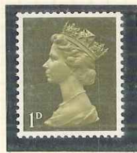
CB. GA 250 COIL