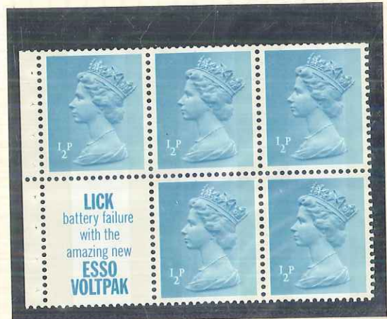
5/71. PERF. L.S.