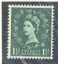
2 B. 8mm