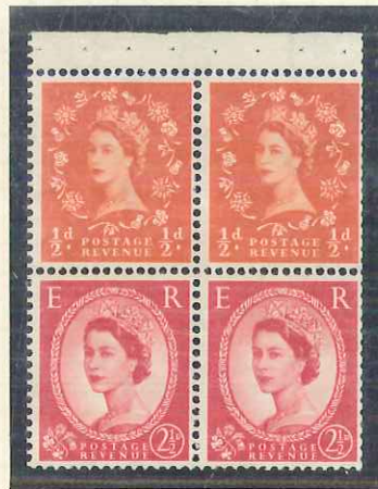
W. SIDE CR. TO R 1/2 d. SHIFT TO R