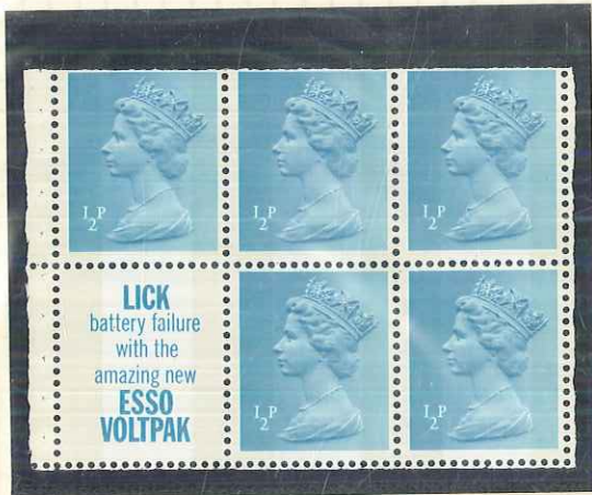
5/71. PERF. L.R