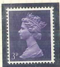
U8. GA. A