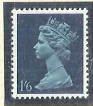
U29. DARK SPOT IN DRESS. TH. G5