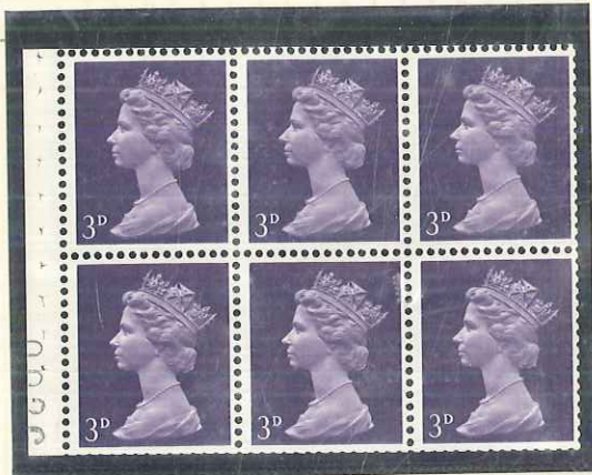
CB. PVA. B. HEAD. 250