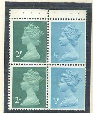
HORZ. GR. HAIR LINE THRO. VALUE, TOP PAIR IOP. BOOK. DEC. 72