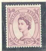
ROSE CUT FROM STEM