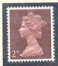
U6. II. PVA. B