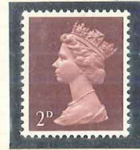
PVA 150 TYPE I