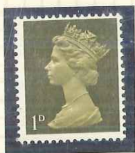
U2. PVA. B