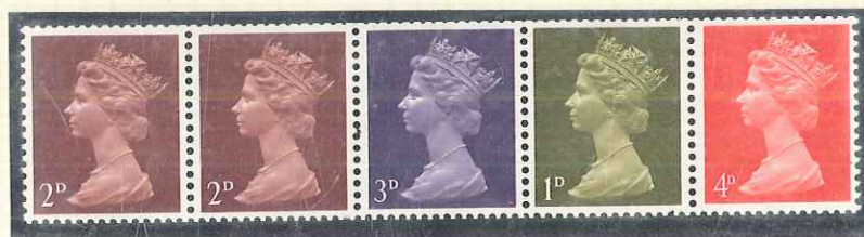
MULTI VALUE COIL STRIP