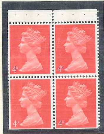
CB. PVA. B. 250. PERF. L 2/1. CHEEK FLAW ALTERING FACE EXPRESSION TH. D2