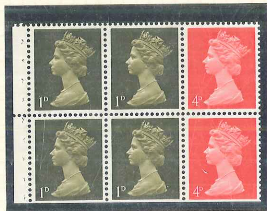
1d. 2 B. 4d LB. PVA. B.250 PERF. L 4d PAIR SHIFT DOWN