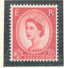
2 B. 8mm II WHITE