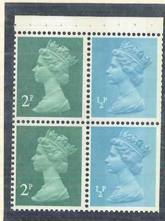
1/2 FOREHEAD & CHEEK RETOUCH IOP. BOOK APR. 72