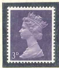
CB. GA. 250 COIL