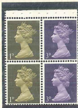
1d PAIR SHIFT DOWN PERF : K