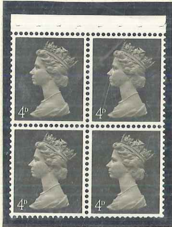
HAIR RETOUCH 1/2. TH. C/3 PERF. J