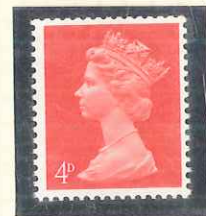
CB. GA. 150 BOOK