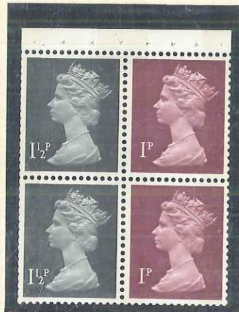
BOTTOM S/T PAIR SHIFT TO RIGHT IOP. BOOK. OCT. 72