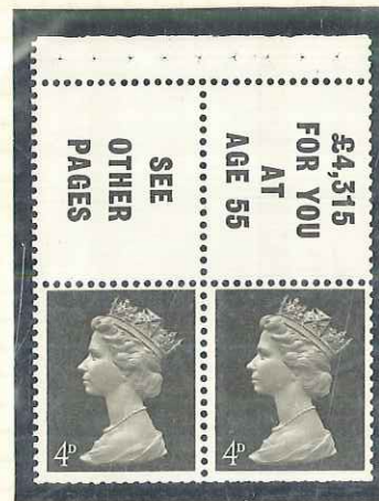
2/1. SERIF TO '4' MISSING