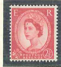
LB. 8mm II WHITE