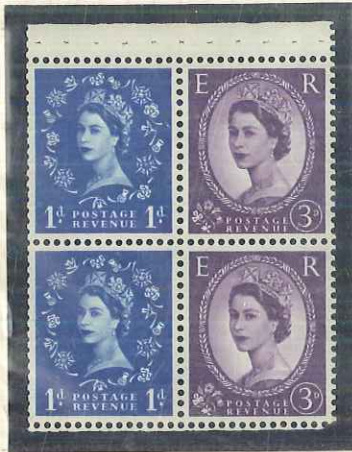
2B. 9.5mm WMK. SIDE CROWN TO L CENT. WHITE LINE OF LAUREL MISSING IN 3d