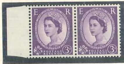
BAND BETWEEN PAIR RB. & LB. 8mm