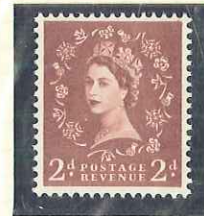
2 B. 9.5mm