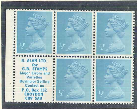
6/71. PERF. K