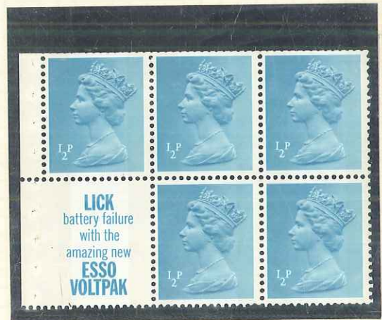
11/71. PERF. L.S. BLIND