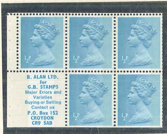
10/71. PERF. L.S. BLIND