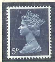
U17. PVA. A