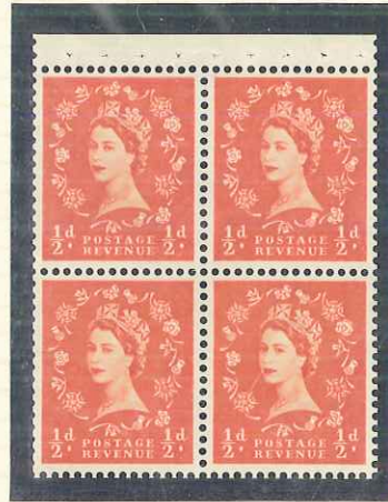
SB. 8a. WMK. INVERTED