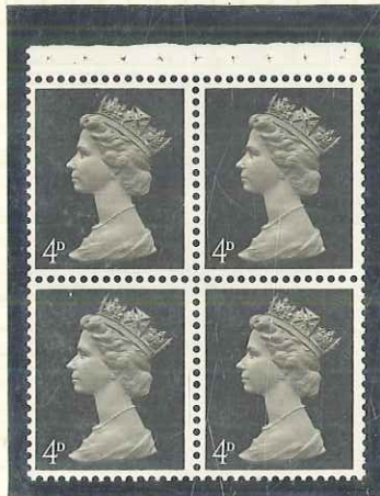
PERF. K TOP PAIR HORZ. SCRATCH