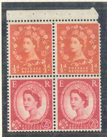
W. SIDE CR. TO L 1/1. d. OF VALUE BROKEN