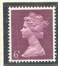
U18. MISSING SERIF TO 'D'