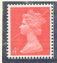
LB.PVB. 250 BOOK