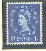
2 B. 9.5mm