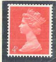
CB.GA. 250 COIL