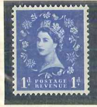
2 B. 8mm