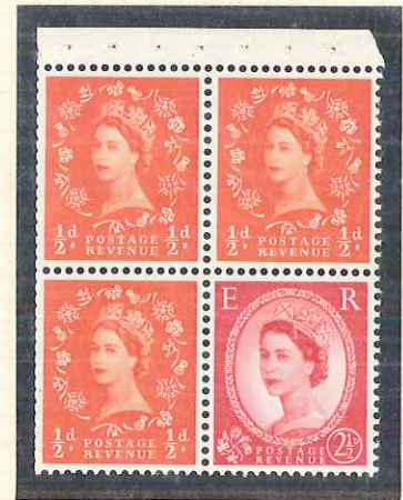
W. INVERTED CHALKY PAPER