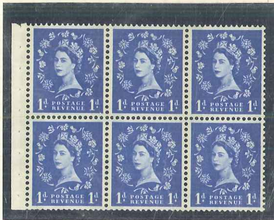
2B. 8mm. VIOLET P