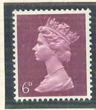
U18. HAIR FLAW CYL. 2. R. 18/1