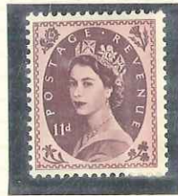
CUT IN FRAME