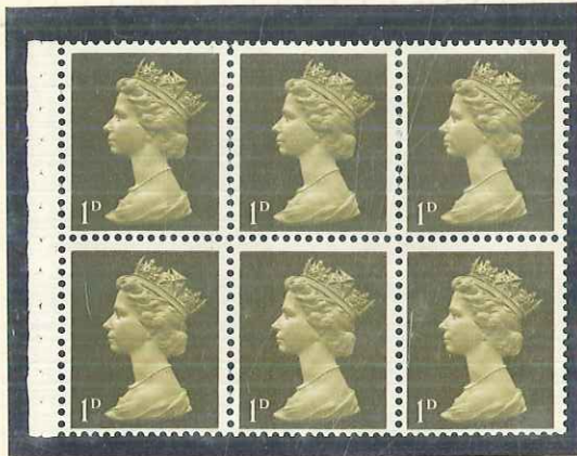
2 B. PVA. B. HEAD. 150. PERF. J