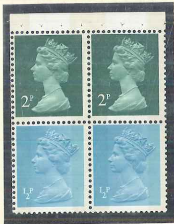
PERF. J 2P. SHIFT TO L