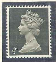
U12. PVA. B