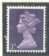
CB. PVA 250