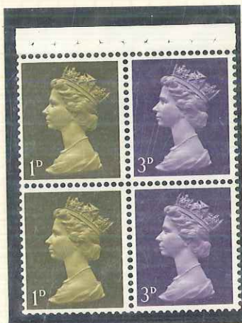
BAND MISPLACED IB 9.5mm R PERF. J