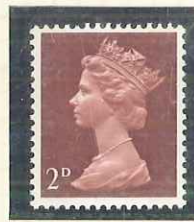
PVA. II 150