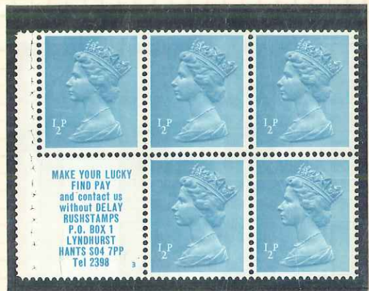
12/72. PERF. M. BLIND DOUBLE STITCH