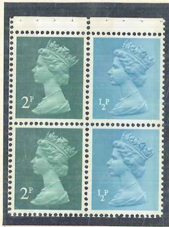
2/2 NICK IN NAPE IOP. BOOK AUG. 72