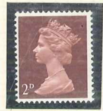
PVA II 250