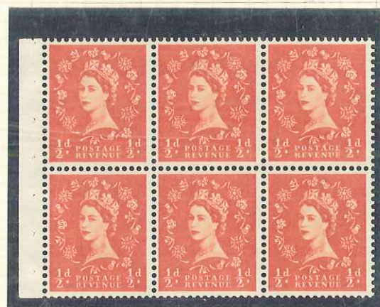
SB. 7a WMK. INVERTED