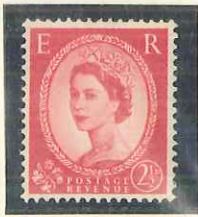
2 B. 8mm TYPE II CREAM