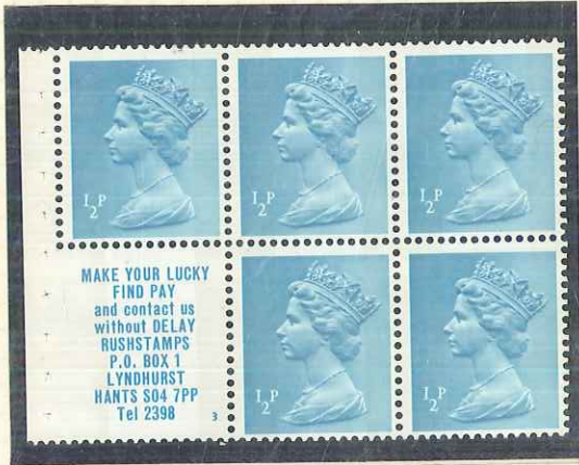
12/72. PERF. K. BLIND