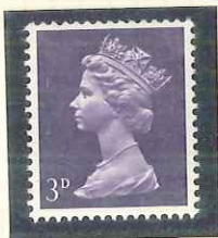
CB. GA. 150