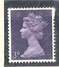
PVA 250 BOOK