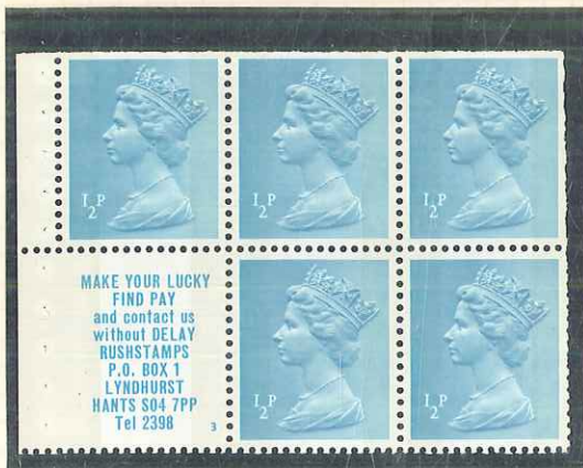
2/72. PERF. L.S. BLIND