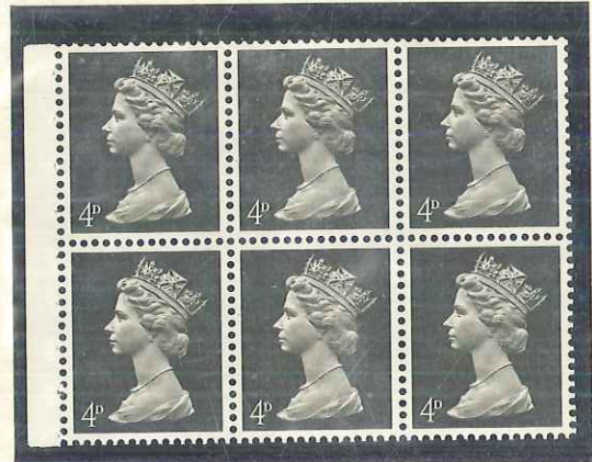
2 B. GA. A. HEAD. 150