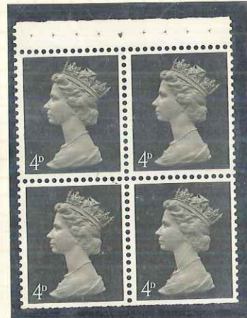
2B. PVA. B. 250. PERF. K TOP PAIR COLLAR SCRATCH