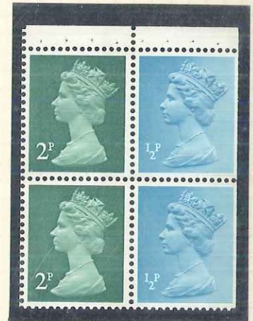
1/1. LEG OF P CORRECTED 2/1. CHEEK RETOUCH IOP. BOOK JUNE 73