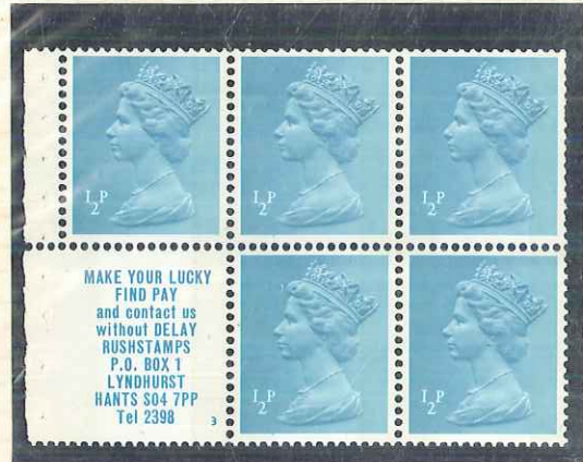
12/72-S. PERF. L.R. BLIND