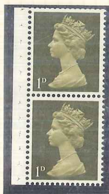
UB. 3. R2/1. TH. E3 NECK RETOUCH