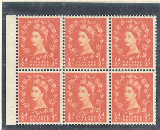
SB. 7. WMK. UPRIGHT