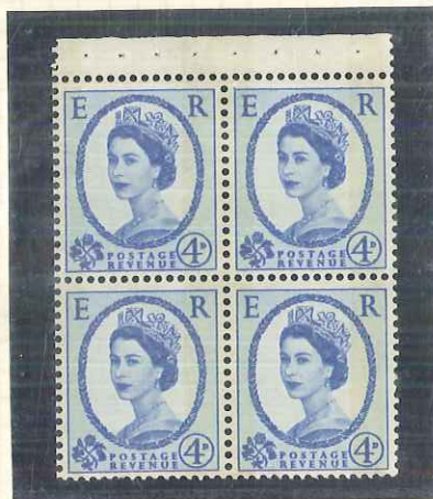
2 B. 8mm VIOLET P. WMK. SIDE CROWN TO L