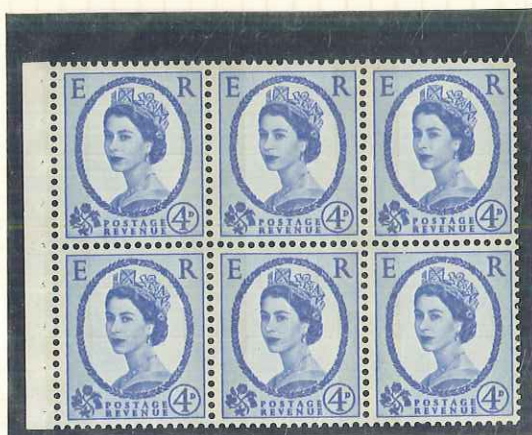
2 B. 8mm VIOLET P. WMK. UPRIGHT