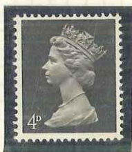
U11. RET. DRESS TH. G3. RET BACK TH. F5