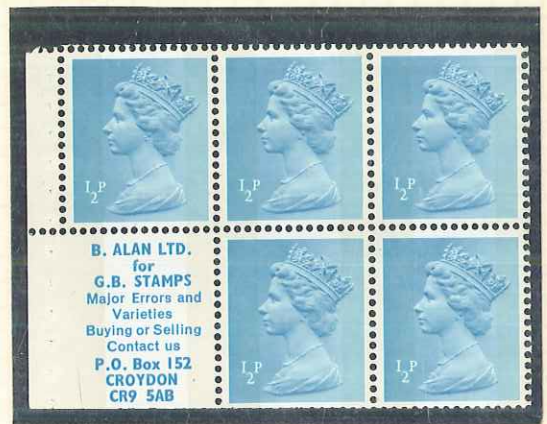
8/71. PERF. L.S. BLIND 2/3. NOSE TIP RETOUCH