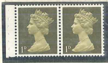
CB. PVA. 250 BOOK