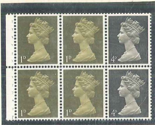
CB. PVA. B. HEAD. 150. PERF. L SLANTING GREEN LINE THROUGH MIDDLE VERT. PAIR