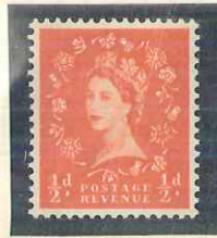
2 B. 8mm