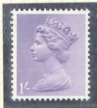
U26. PVA. A