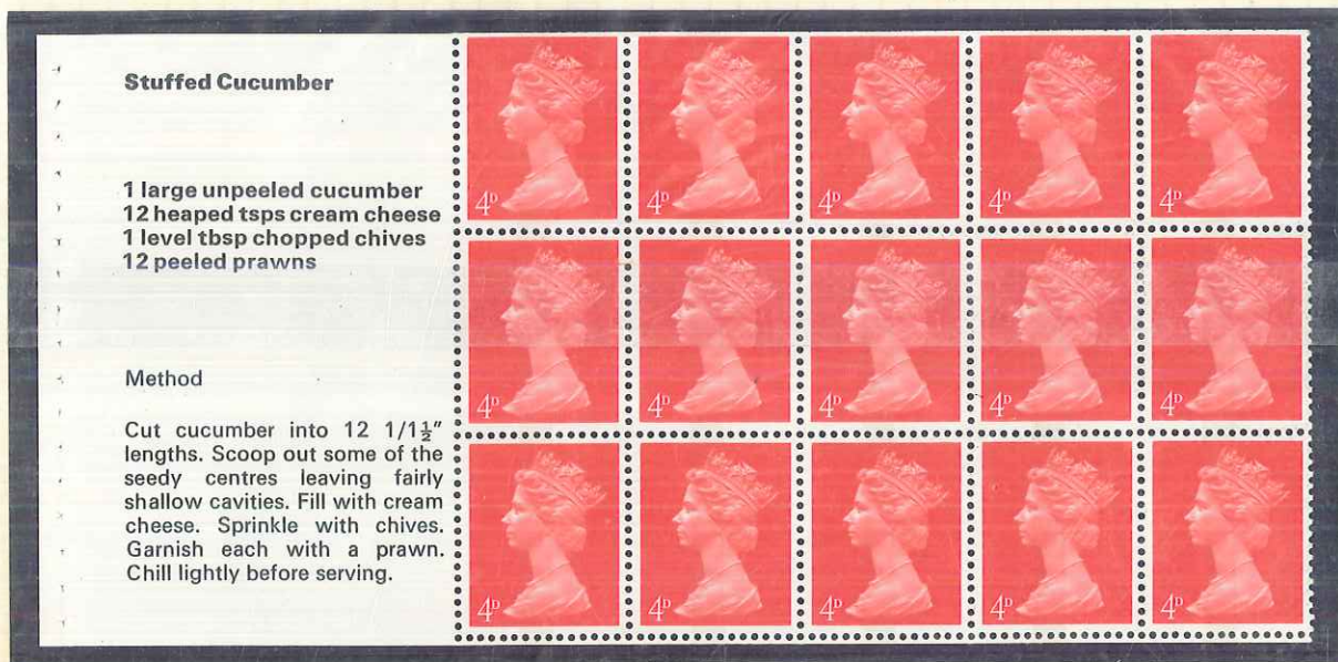
"RECIPE" PANE. CB. VALUE LOW