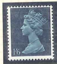
U27 (3). GA. A