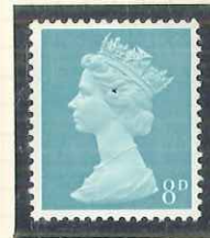
U21. WHITE FLAW ON CHEEK TH. D3.