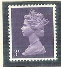
CB. PVA. 250 COIL