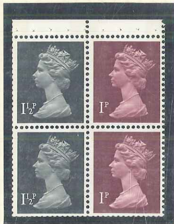
2/2. ONE SIDE SERIF TO 1 MISSING IOP. BOOK. JUNE 73