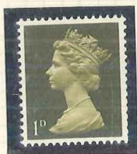
U 9. CHEEK RETOUCH. TH. D3