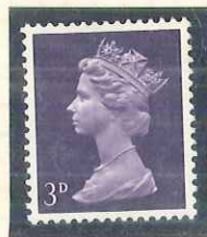
U9. NECK RET. CYL. 3. R. 12/7. TH. F4