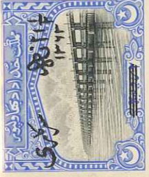
Deep red opt.

MARCH 1945. 1933 UNISSUED VALUES OVERPRINTED AND SURCHARGED IN PERSIAN.