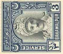
1945. H.H. THE AMIR OF BAHAWALPUR.