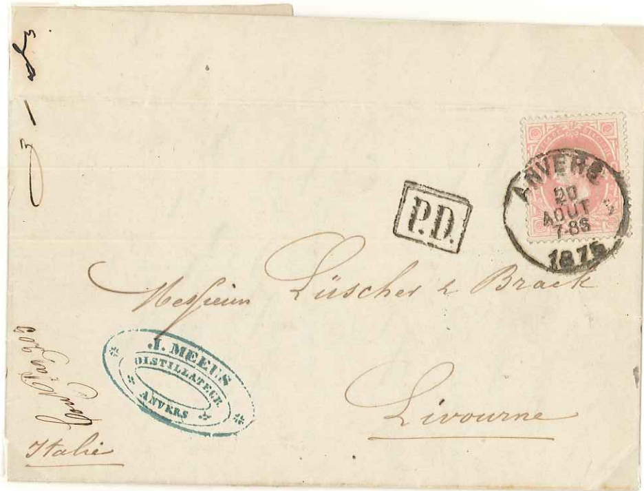
A letter from Anvers to Livorno, Italie, August 20, 1875. Franked by pale salmon 40 cent stamp. On the back an arrival CDS, Livorno, August 23, 1875.