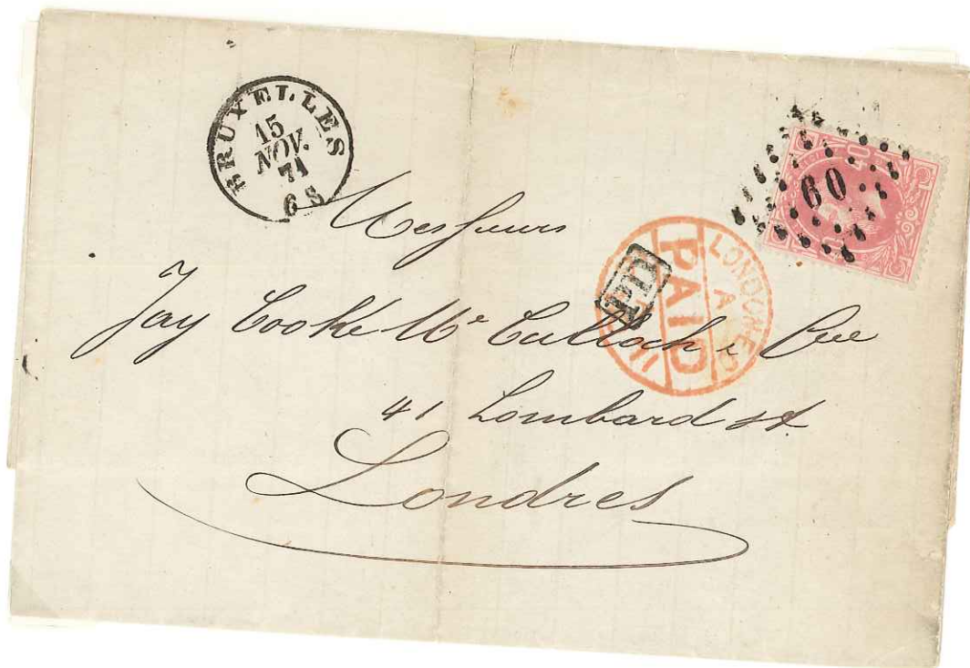
A letter from Bruxelles to London, November 15, 1871. Correctly franked by pale red-carmine stamp perforation 15.