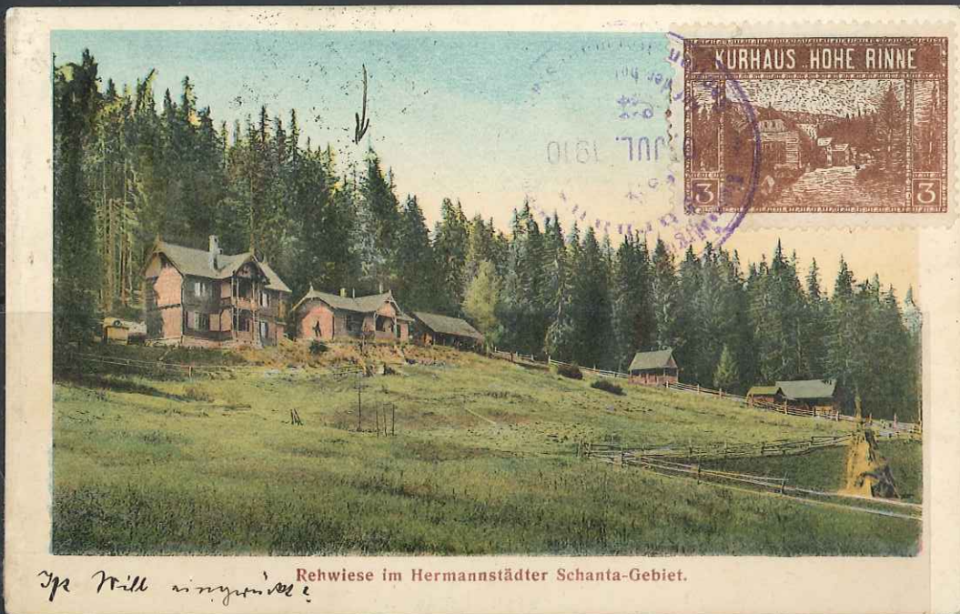
Im Mill eingetragene Rehwise im Hermannstädter Schanta-Gebiet.