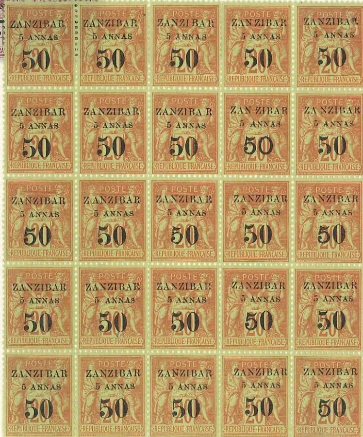
TROIS TYPES (19+5+1)