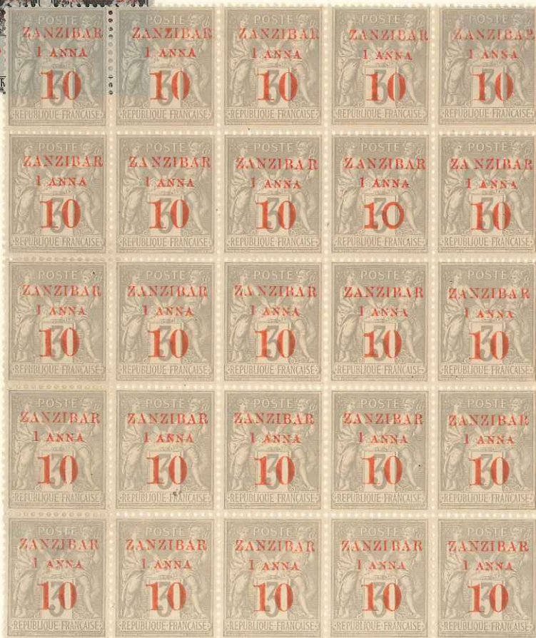
TROIS TYPES (23+1+1)