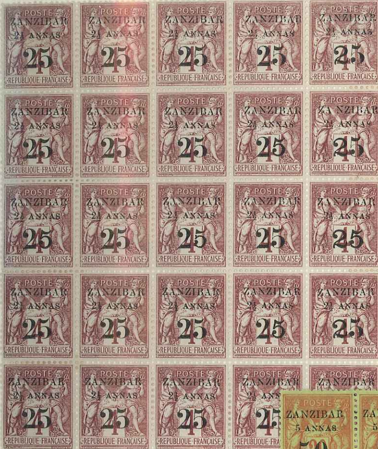
QUATRE TYPES (16+4+3+2)