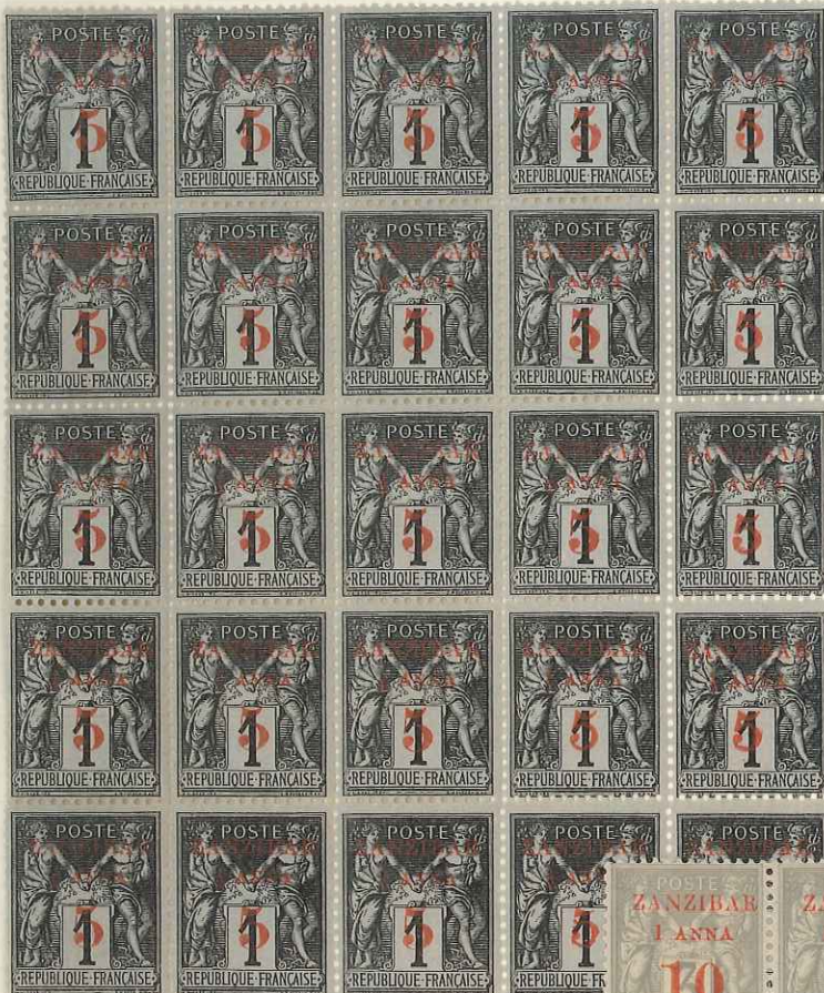
DEUX TYPES (19+6)