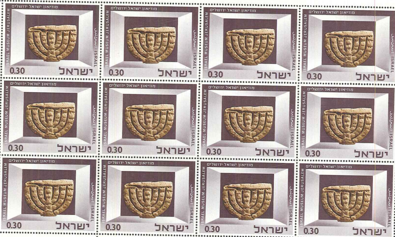
מנורה מבית כנסת - אבן מאה ב' לסה"נ - טבריה SYNAGOGUE STONE MENORA SECOND CENT. C.E. · TIBERIAS