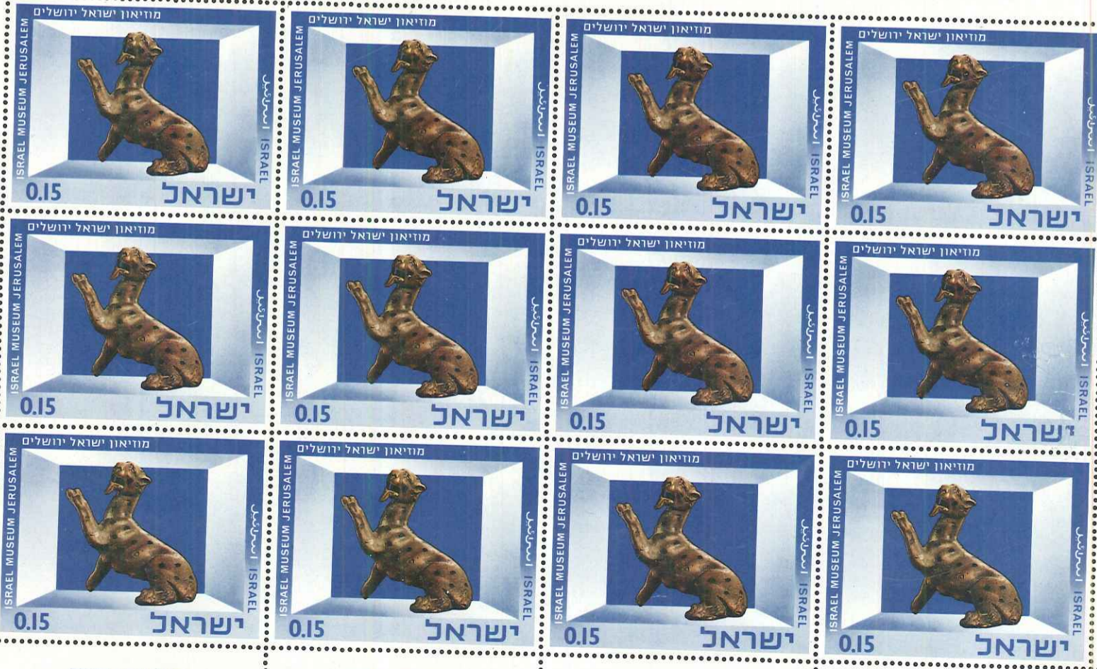
פסיל נמר - ברונזה מאה א' לפסה"נ - מאה א' לסה"נ - עבדת BRONZE PANTHER FIGURINE FIRST CENT. B.C.E. - FIRST CENT. C.E. AVDAT