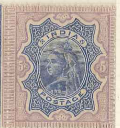
Plate Registration: 2r 19 th April 1895; 3r 25 th April 1895; 5r 2 nd May 1895.

EXETER/PLYMOUTH LEAF No. 3833 (Facing) No. 3831 (Unfaced) STANLEY GIBBONS PUBLICATIONS LTD. LONDON MADE IN ENGLAND